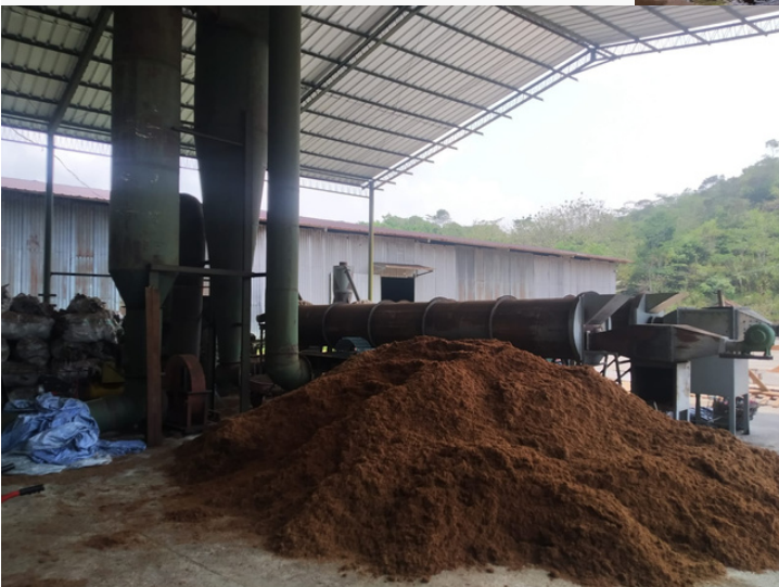
Coco Peat Shredder, Decomposing, Watering, and Squeezing Machine