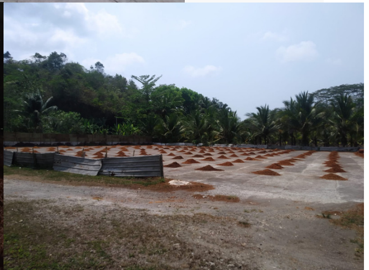
Coco Peat Factory and Warehouse