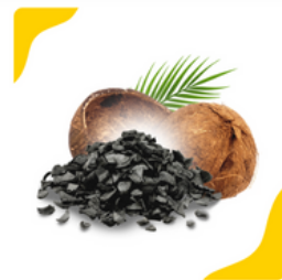
Coconut Shell Charcoal