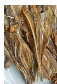
Dried Salted Jambong Fish