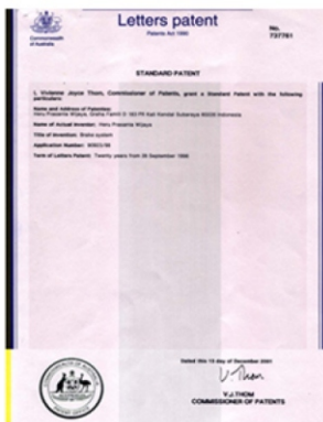
AUSTRALIAN PATENT BRAKE SYSTEM