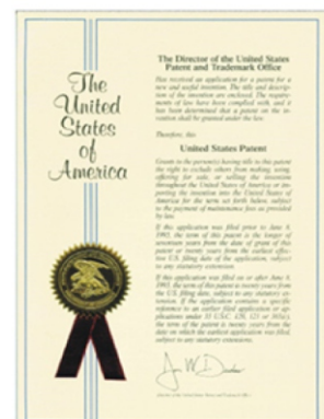
AMERICAN PATENT BRAKE SYSTEM