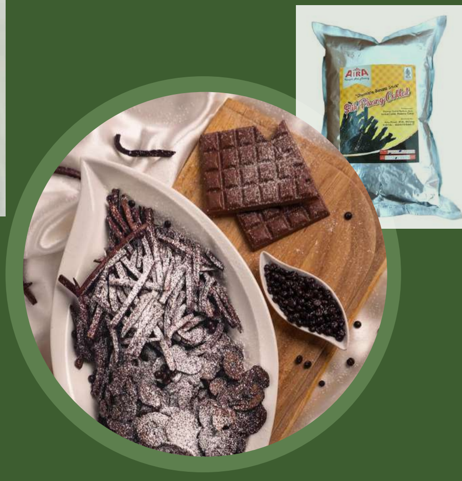
CHOCOLATE BANANA STICK