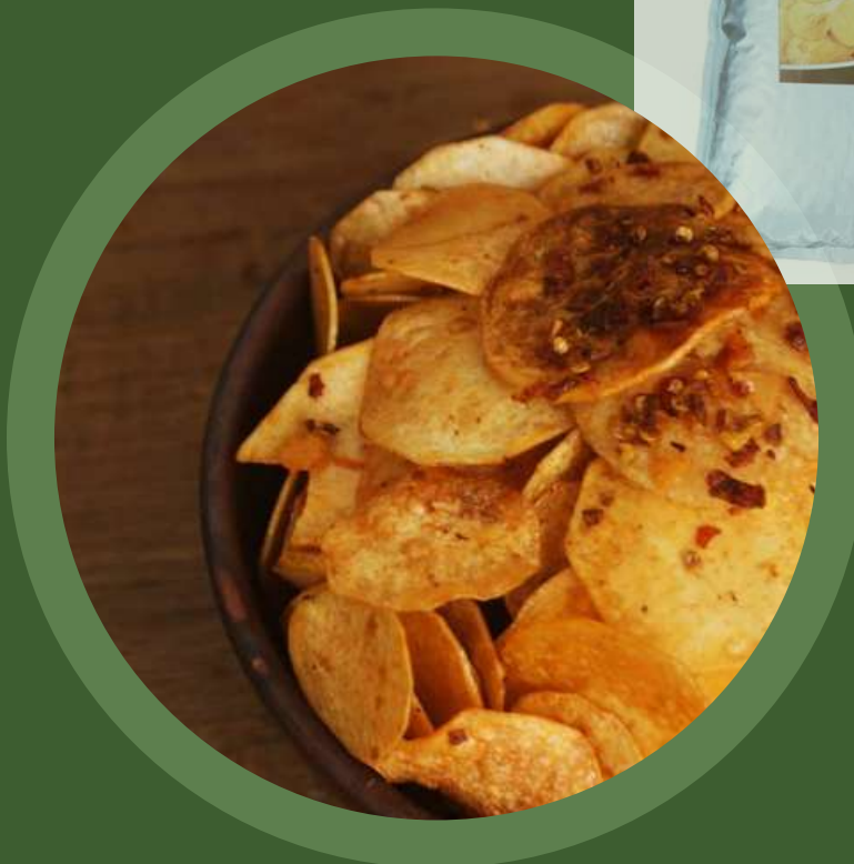
SPICY CHEESE CASAVA CHIPS