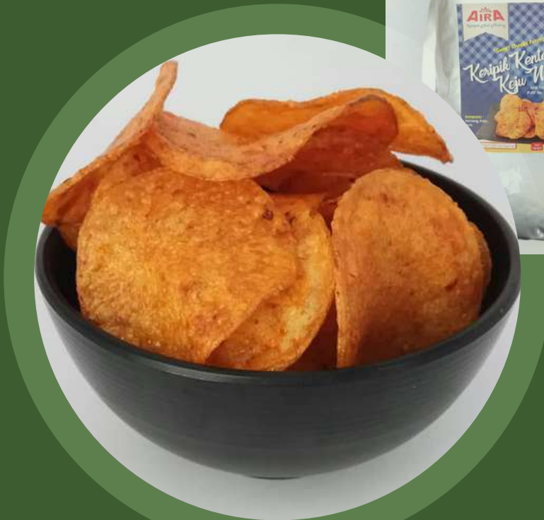
SWEET CHEESE POTATO CHIPS