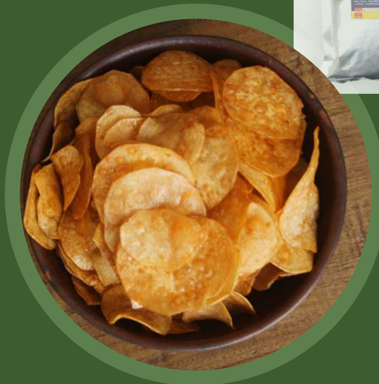
SWEET CHEESE TARO CHIPS