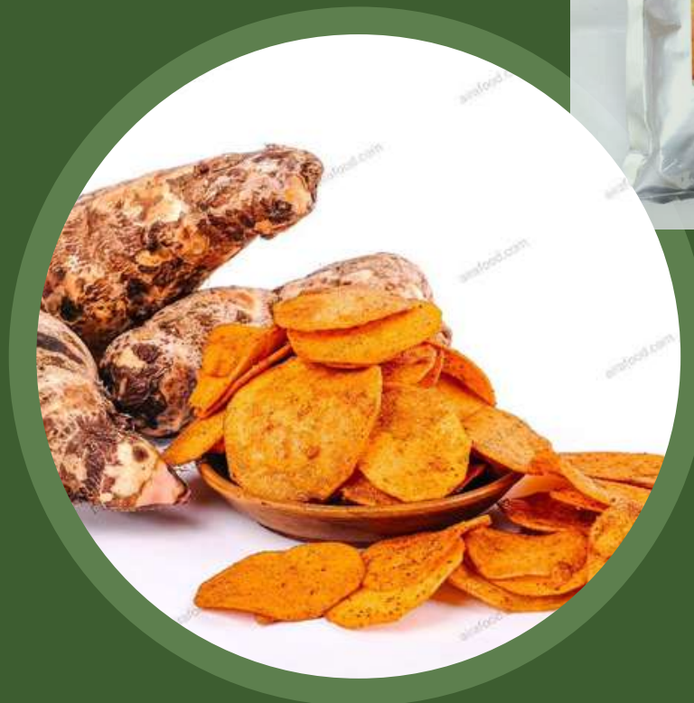
SWEET CHEESE CASAVA CHIPS