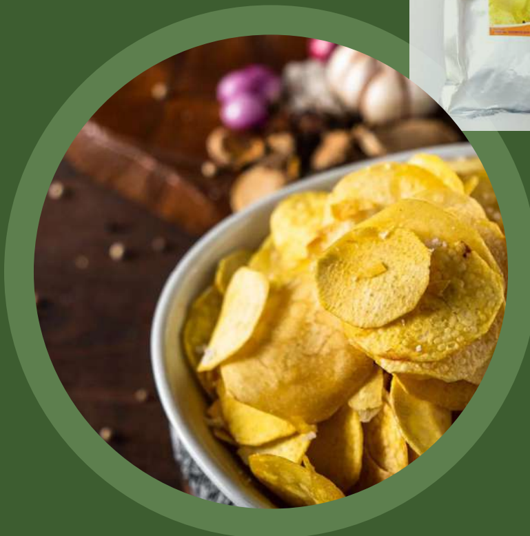
ORIGINAL TARO CHIPS