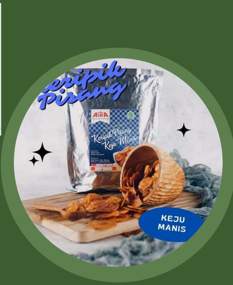
CHEESE BANANA CHIPS