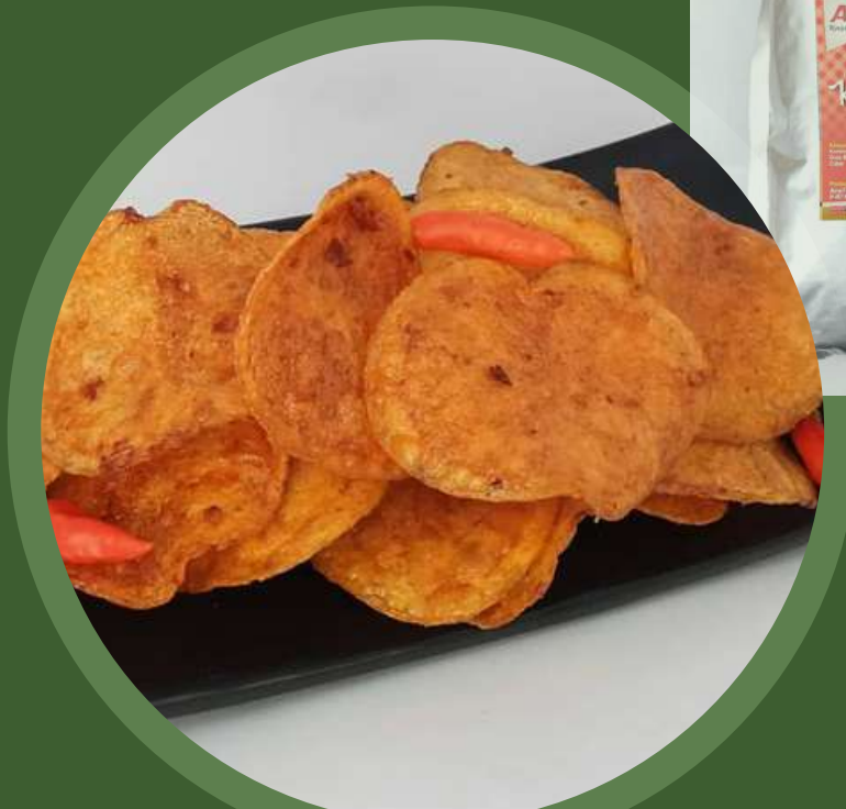
SPICY CHEESE POTATO CHIPS