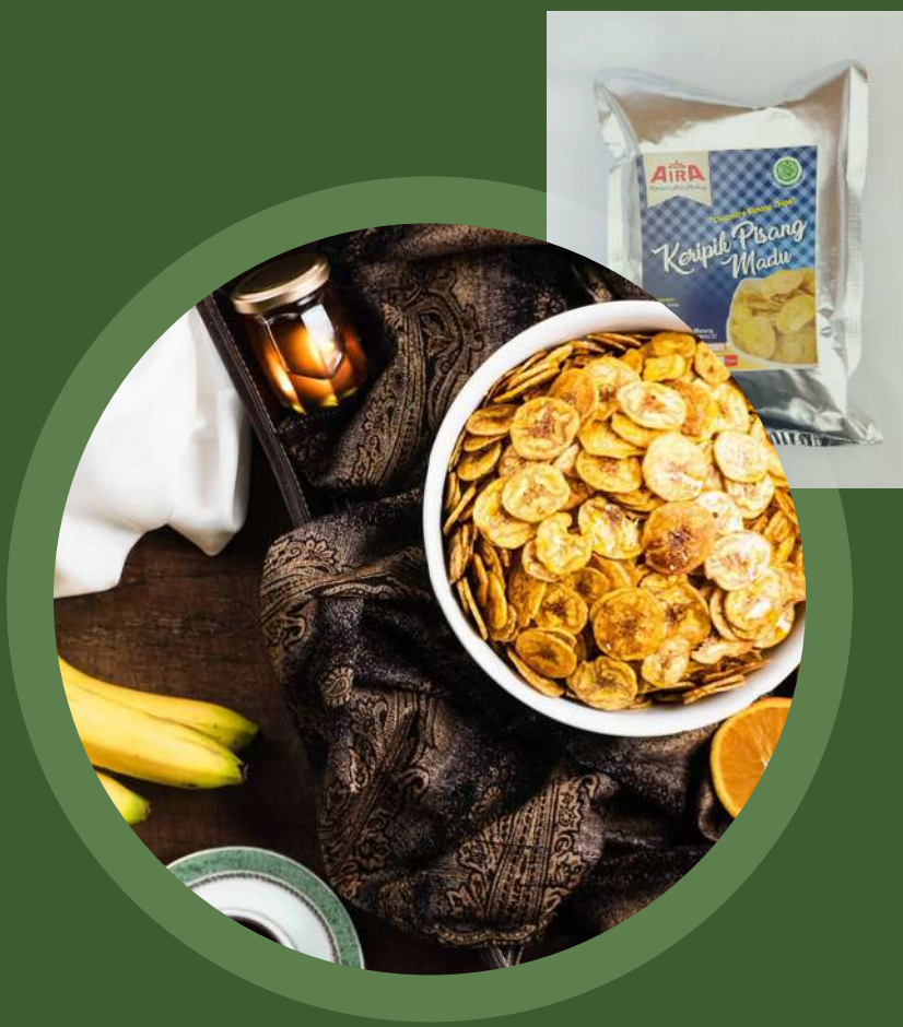
HONEY BANANA CHIPS