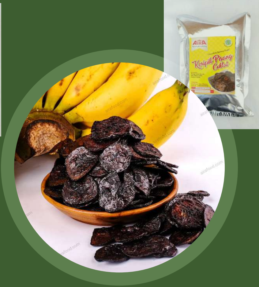
CHOCOLATE BANANA CHIPS