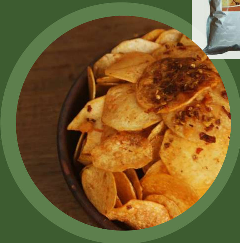
SPICY CHEESE TARO CHIPS