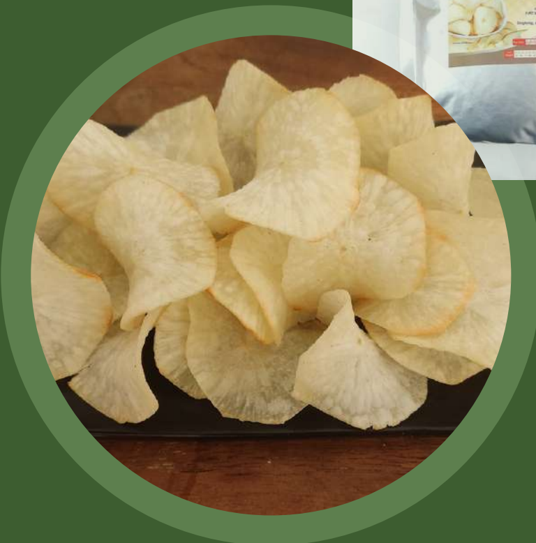
ORIGINAL CASAVA CHIPS