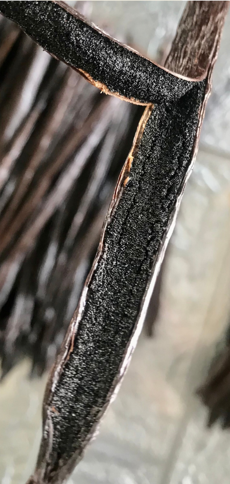
Palm From Indonesia