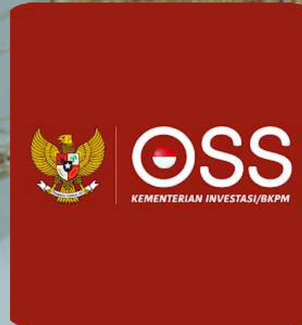
Online single submission