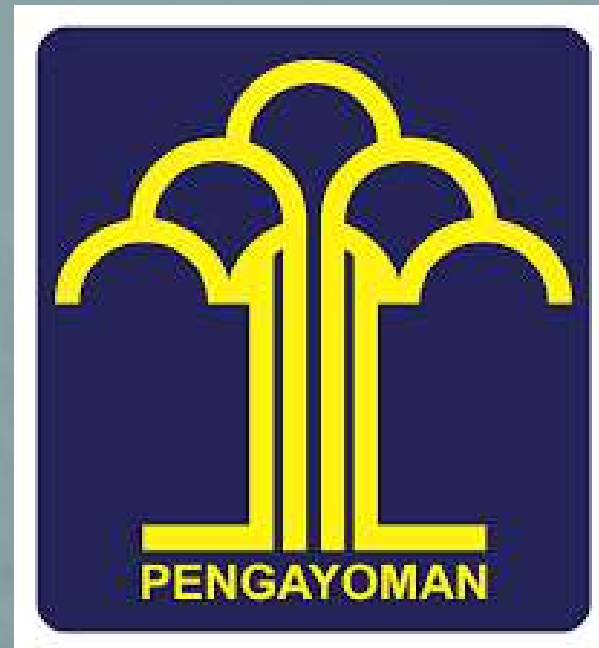
Kementerian Hukum dan Hak Asasi Manusia Republik Indonesia.