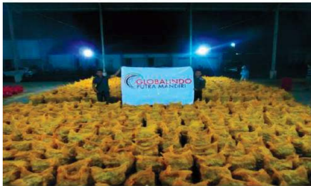
Export Ginger To Vletnam