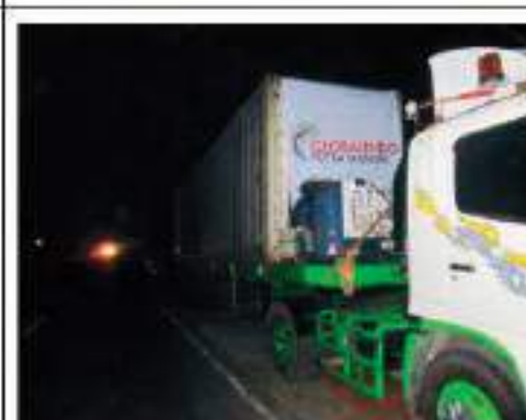
Loading To Bangladesh