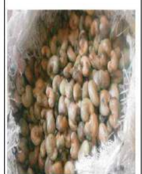
Check Raw Material