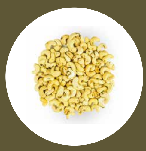
RAW CASHEW SK1