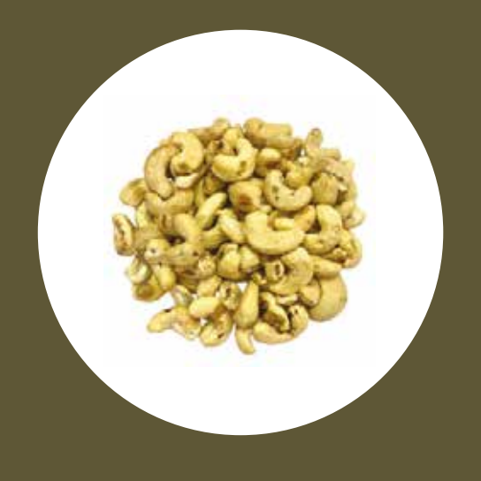
RAW CASHEW SK 2