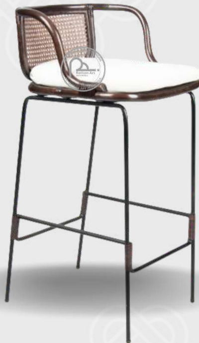
Rattan chairs are combined with iron frames of various shapes.