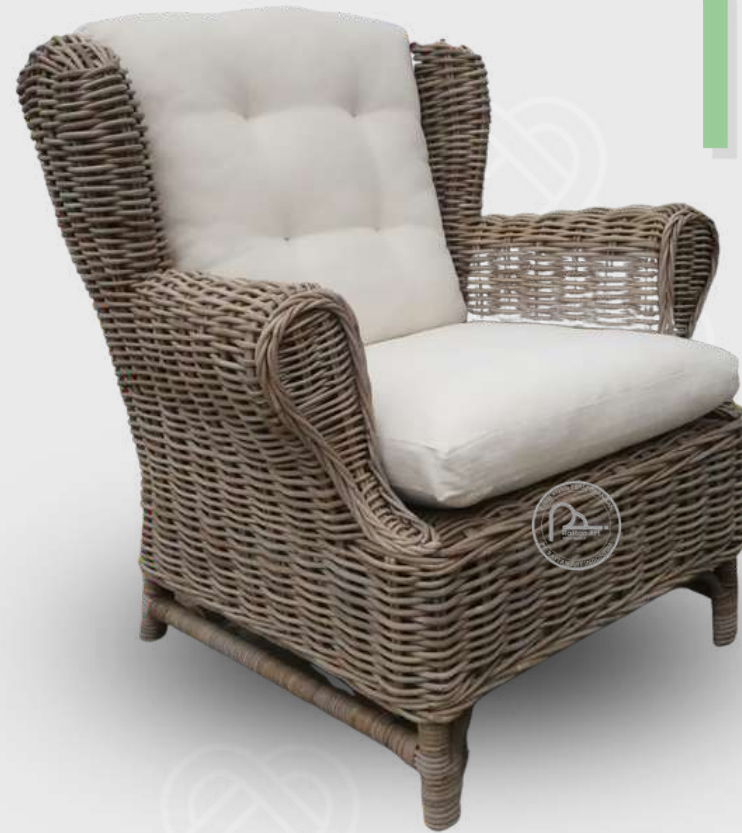
Rattan Gray Sofas & Chairs