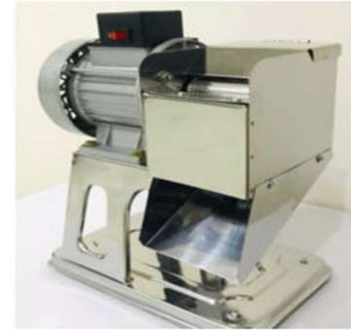
Coconut Meat Crushed