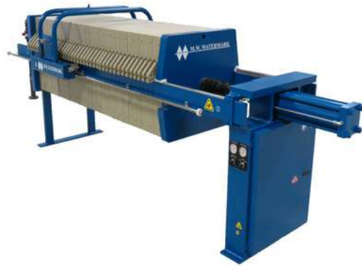
Filtered, To Separate Oil & Copra Meal