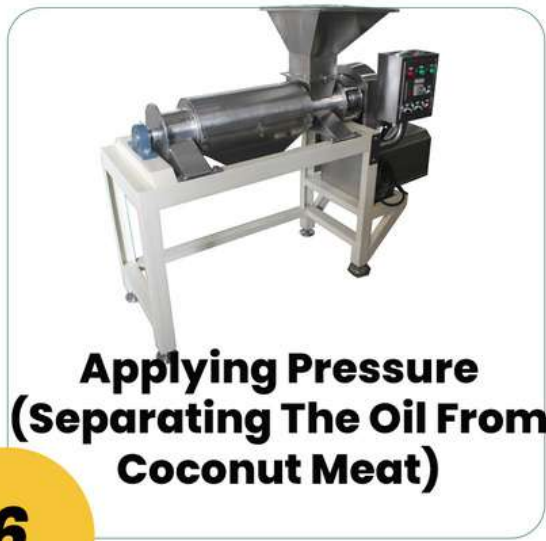
Applying Pressure (Separating The Oil From Coconut Meat)