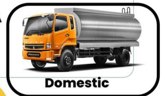
Domestic Delivery To Customers