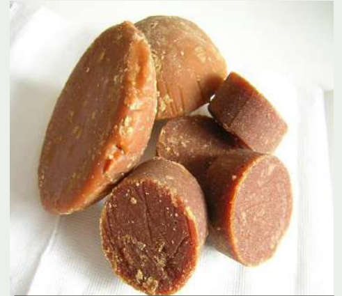
Lump Organic Coconut Sugar