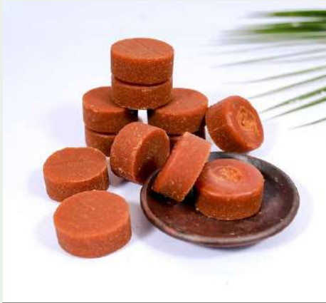
Block Organic Coconut Sugar