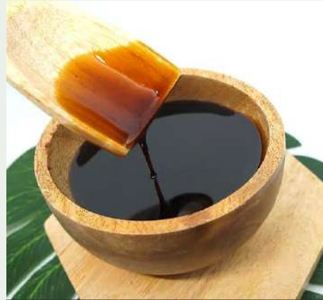
Liquid Organic Coconut Sugar