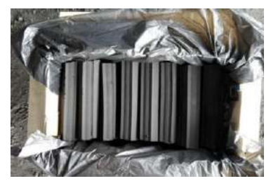
CARTON BOX WITH INNER PLASTIC