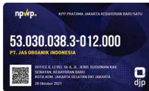
Tax Number: (NPWP) 53.030.038.3-012.000