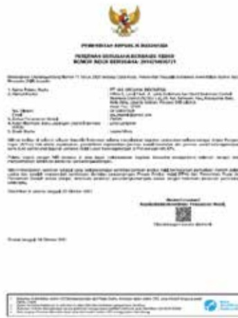
Business Identification Number: 2910210036721