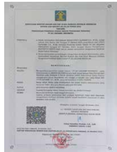
Decision Letter Number: AHU-0067897.AH.01.01. (2021)