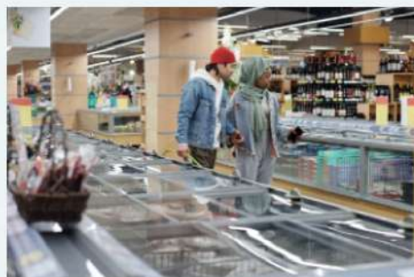
Modern Trade Chain