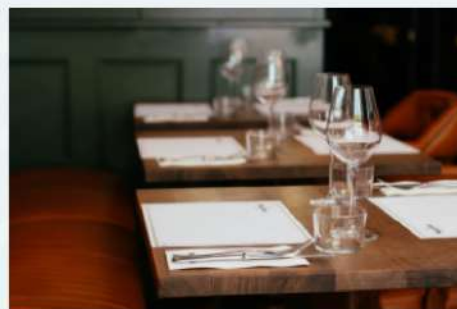
Restaurant & Hotels