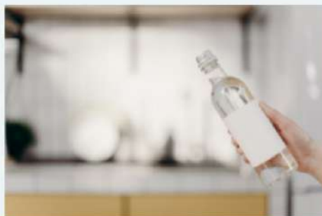
Private Label Customers