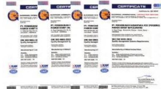
SNI ISO 9001 : 2015