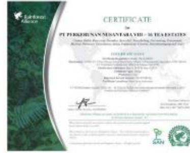
RAINFORREST ALLIANCE (RA)