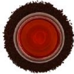
BP1 Broken Pekoe