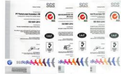
ISO 9001 : 2015