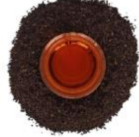
BT Broken Tea