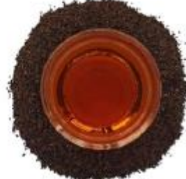
PF Pekoe Fanning