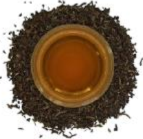
BOP1SP Broken Orange Pekoe