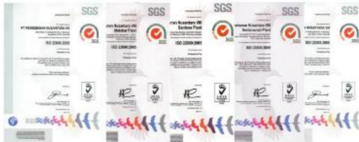
ISO 22000 : 2005