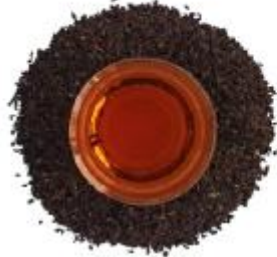
BOP1 Broken Orange Pekoe 1