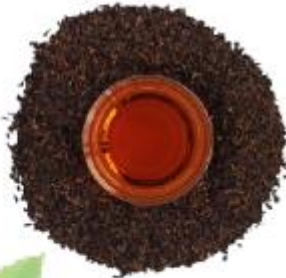
BP Broken Pekoe