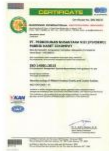
ISO 14000 : 2015