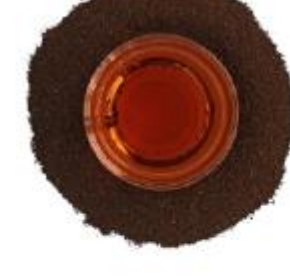
D1 Dust 1