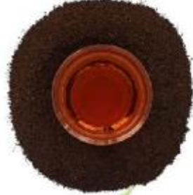
PD Pekoe Dust