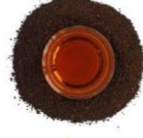
PF1 Pekoe Dust 1