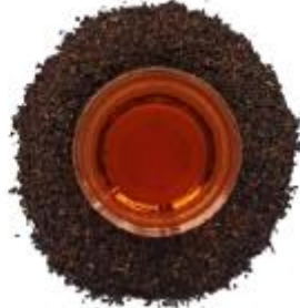
BOP Broken Orange Pekoe