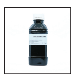
PRODUCT : FATTY ACID B. SPECIFICATION

FFA (%) 5 Max Moisture (%) 0.5 Max PORAM standard