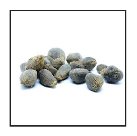
PRODUCT: NUT KERNEL SPECIFICATION

FFA (%) 200 MIN Moisture (%) 1 Max Low Metal impurities