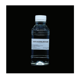
PRODUCT: FA ALCOHOL B SPECIFICATION

FFA (%) 200 MIN Moisture (%) 1 Max Low Metal impurities