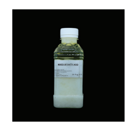
PRODUCT: MIXED FATTY ACID SPECIFICATION

Oil Content / Fat (%) 20 Min Moisture (%) 10 Max Protein (%) 20 MIn Fiber (%) 8 Min