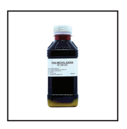
PRODUCT: PAO-ME SPECIFICATION

FFA (%) 200 MIN Moisture (%) 1 Max Low Metal impurities