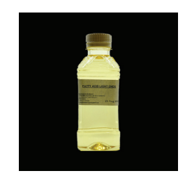
PRODUCT: FATTY ACID LE SPECIFICATION

FFA (%) 200 MIN Moisture (%) 1 Max Low Metal impurities