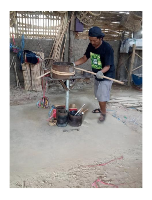
Bending and Curving

Inheriting one of the most popular tradition of making furniture in Cirebon, Mulya Rattan contributes to its preservation for the next centuries. Our tradition is embodied into one of the most beloved furniture and craft styles in the world, that is rattan furniture and handicrafts.