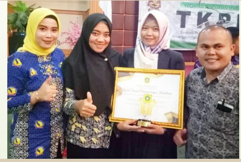
2017, The Most Inspired 100 New Young Entrepreneurs in West Java, Indonesia