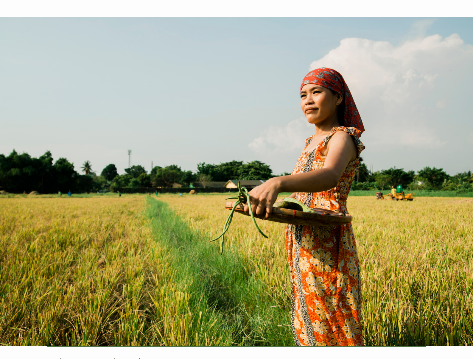
Palm From Indonesia

Palm From Indonesia committed In making only the best organic Indonesian palm sugar to respect the environment and maintain good quality. That is because we believe in supporting the sustainable agriculture concept by providing the best of Indonesia's natural resources to the world.