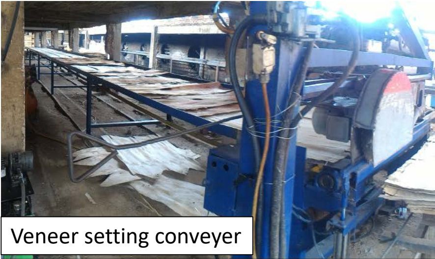
Veneer setting conveyer