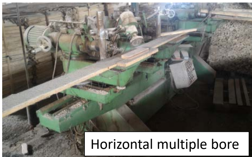
Horizontal multiple bore