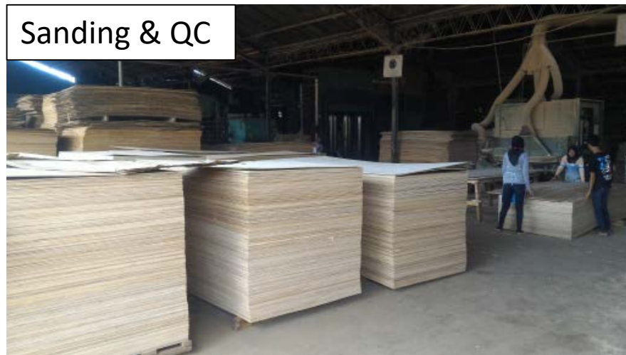
Sanding & QC