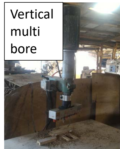
Vertical multi bore