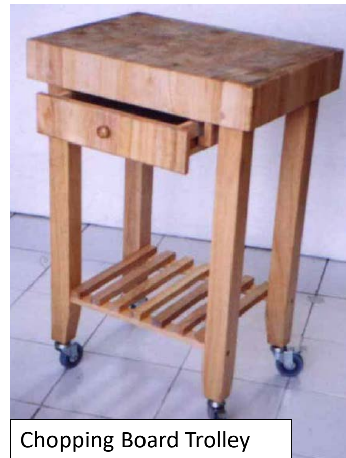
Chopping Board Trolley