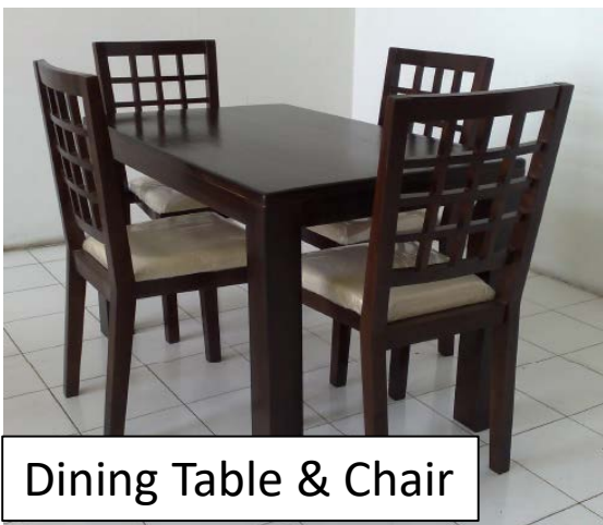
Dining Table & Chair