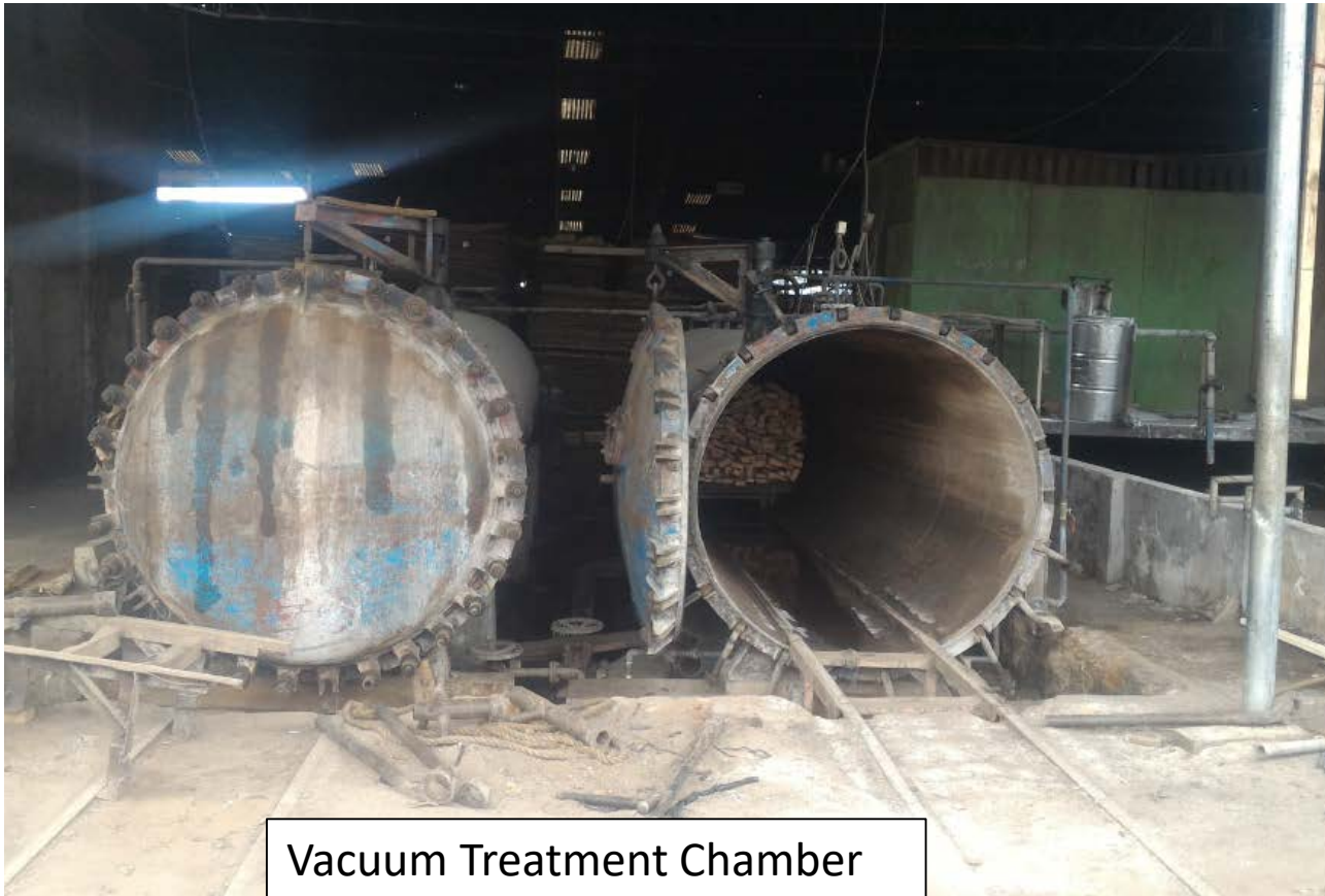
Vacuum Treatment Chamber