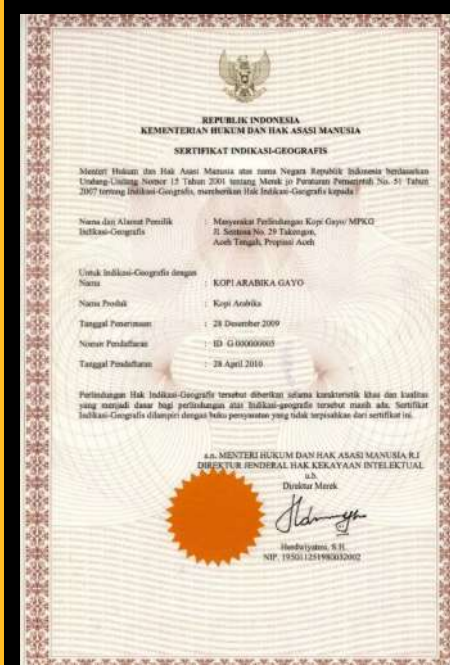
Certificate of Geographical Indication of Gayo Arabica Coffee