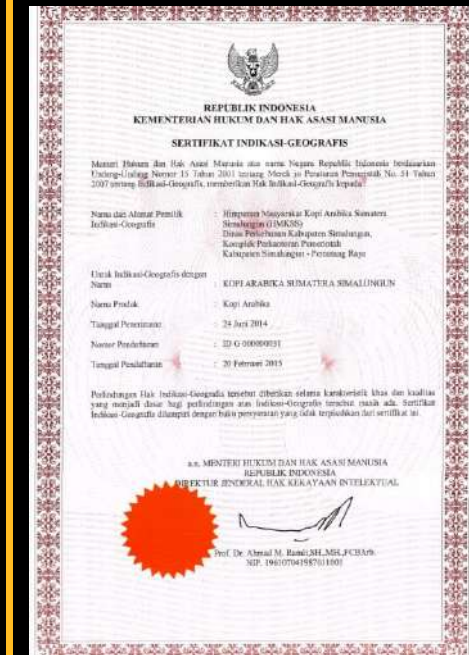
Certificate of Geographical Indication of Simalungun Arabica Coffee