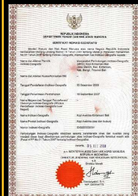
Certificate of Geographical Indication of Bali Kintamani Arabica Coffee

License as a Registered Coffee Exporting Company is stipulated by the Government of the Republic of Indonesia.