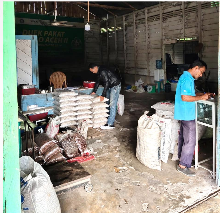
CANDLENUT, NUTMEG, CLOVE, CARDAMOM, ANISE WAREHOUSE