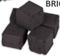
CHARCOAL COCONUT BRIQUETTE

Copra is the dried flesh of coconuts. Every adult coconut tree bears 50-75 nuts that can be harvested, split with machetes and left to dry in the sun. The copra is then scraped out of the husk and gets to dry further on racks. Finally, it is packed in jute bags and transported to a processing facility.