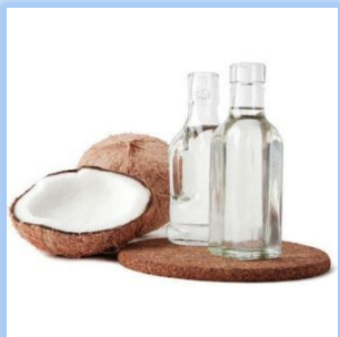
Virgin Coconut Oil