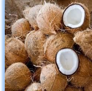
Coconut Semi Husked