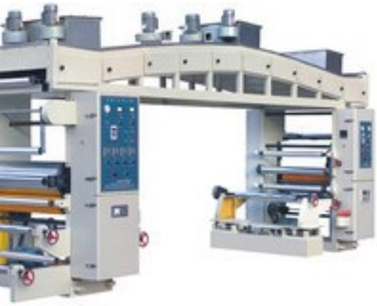
Lamination (4 units)