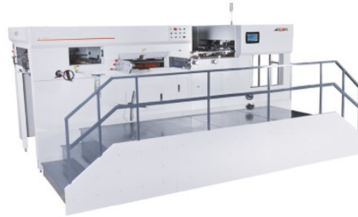
Hot stamp & die cut automatic (2 units), manual (14 units)