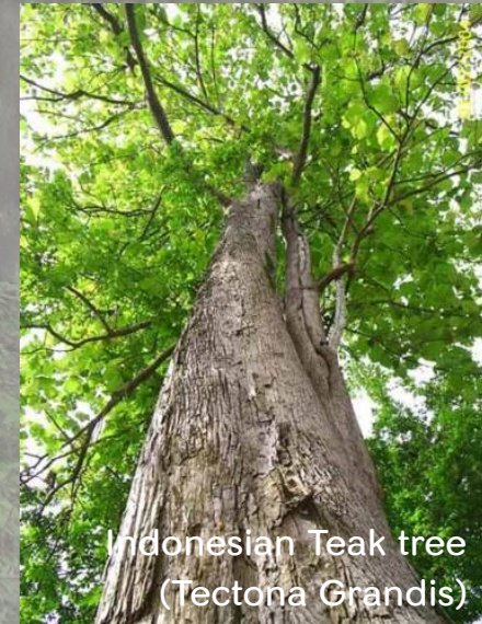
Indonesian Teak tree ( Tectona Grandis )

Mahogany tree ( Toona Sureni ) are well known tropical hard wood trees valued for its oil content, dense grain, and strength thus giving final furniture product long durability and weather resistance properties.