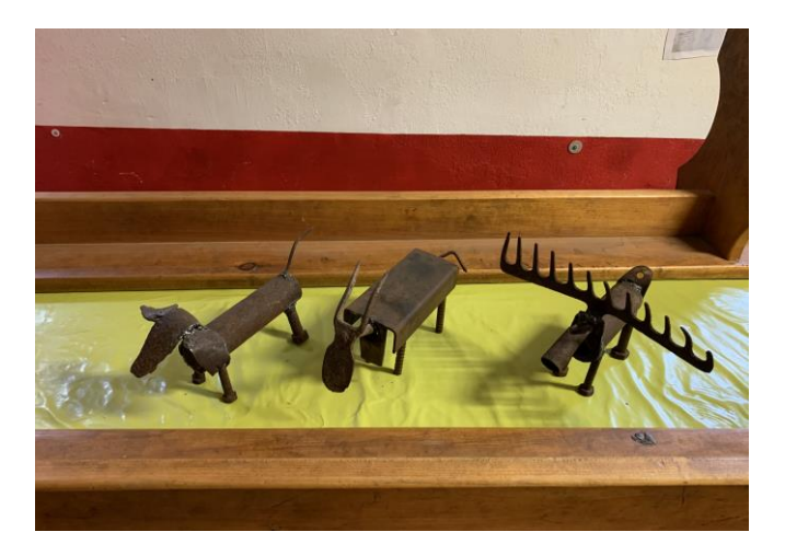
Sculptures made by one of the residents that occupied his afternoons learning this type of art, in an autodidactic way.

La Ferme de Moyembrie also impacts the lives of 40 volunteers and 9 employees, hired not only to supervise agricultural or technical activities (such as farming, cheese production, livestock and maintenance of vehicles), but also to manage the daily life of the farm: these workers provide social support for residents, develop partnerships and make part of the decisions to welcome or exclude a resident.