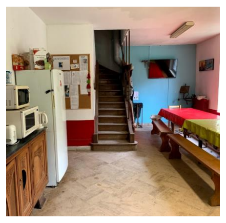
It is in the common room that meal that place, with lunch being the only community meal as a mandatory rule, so that residents can regain life.