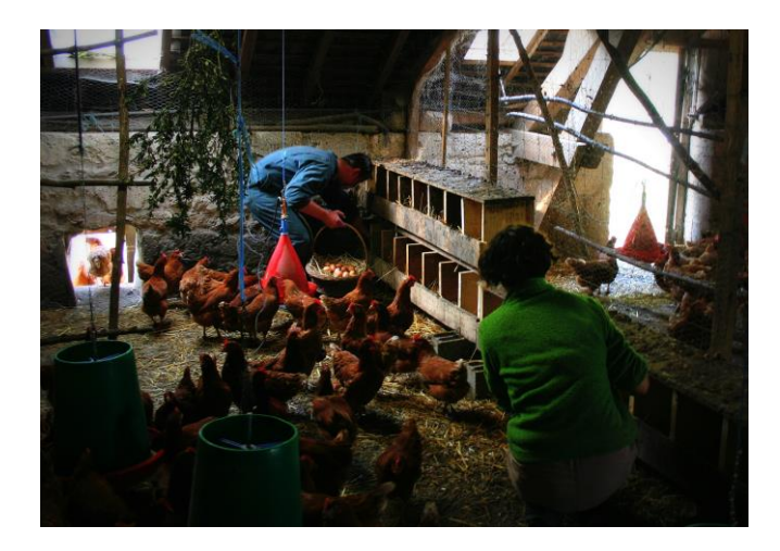
There are about 200 chickens and 40 goats for cheese production at the homestead.