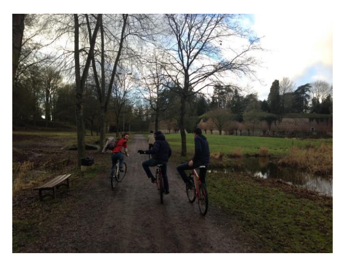
An outing for a bike ride.

This placement à l'extérieur manages, not only matters regarding logistics and spaces, but also the residents' routines and security. There are no prison guards in the homestead . This is perhaps the most representative indicator of one of the key elements to the success of this project: the principle of trust in the residents. The experience of being trusted can be transformative in any circumstance, but this transformative potential is enhanced when there is a risk or a space to let down. The absence of prison guards and of a permanent control of residents, either by caution or by default,