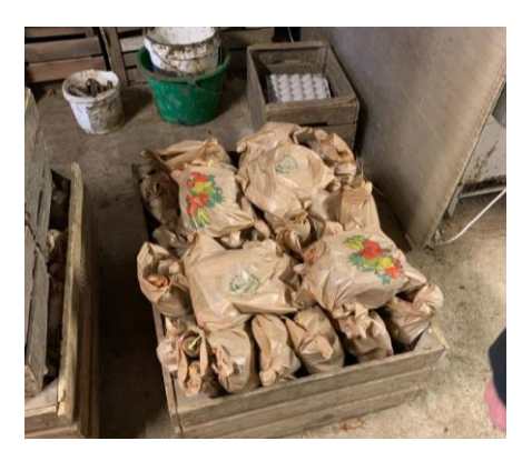
La Ferme de Moyembrie is a certified organic farm that supplies 140 baskets of vegetables a week, during the entire year.