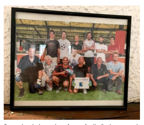
Framed photograph of a football tournament organized by a local sports association, in which some residents participated

The La Ferme de Moyembrie receives annually around 50 residents, responding to just 1/3 of the 150 requests for admission that the project receives. Since 2000, more than 500 people have benefited from this project. Each resident stays on the homestead for an average of 9 months, a time that must be delimited and is considered sufficient to intermediate a life in freedom: La Ferme de Moyembrie must serve as a springboard for an exit that is desired to happen. All residents have a housing solution once they leave the homestead and, in the three subsequent months, 60% of the ex-residents find a life orientation or occupation, whether it is a job, training, retirement or integration in an Emmaus community.