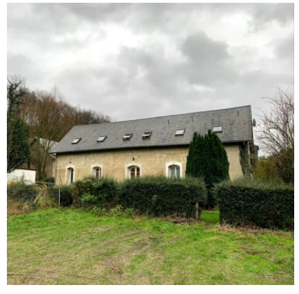
Residents live in a house located in La Ferme de Moyembrie, where each one has their own room, to relearn privacy.