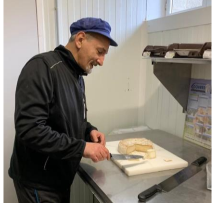
The dignifying results of the work experience at La Ferme de Moyembrie radiated from one of the residents who came to dominate the various steps of cheese production.

At the core of the success of this project are the life rules that are clearly displayed and explained to