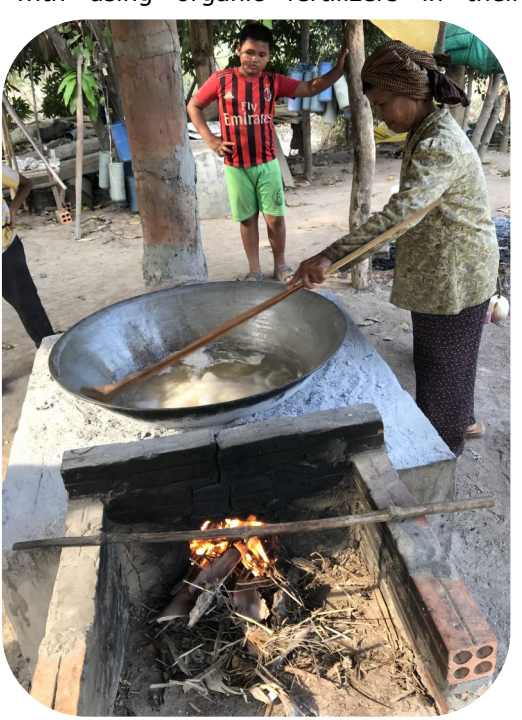
Input credit from Mekong Ingredients is partially used for improved cookstoves for palm sugar processing

In one of the provinces where CACC currently operates, Preah Vihear, smallholder farmers are yet unfamiliar with using organic fertilizers in their