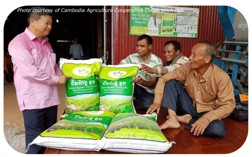
Organic fertilizer provided by CACC that is made from by-product from rice processing

In terms of scaling and expanding the supply chain, both ventures have the intention to increase the number of ACs they work with over time. Following the first piece on "Smallholder as true shareholders", both have managed to do so with on-going discussions with additional ACs to join. For CACC, they are currently preparing to release more shares in the venture to enable more ACs to join, including ACs in other provinces. To encourage more ACs with female leaders to join the venture, they offer a reduced price for buying shares. They have also ventured into sourcing different produce from the same group of farmers, expanding into cassava, pepper and cashew nuts. Mekong Ingredients have initiated partnership with two more ACs but they are yet to become shareholders of the venture as the venture focuses on strengthening internal operations and procedures before scaling with new ACs.