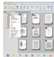
PaperPort SE 14

- The Professional Choice to Organize and Share Your Documents