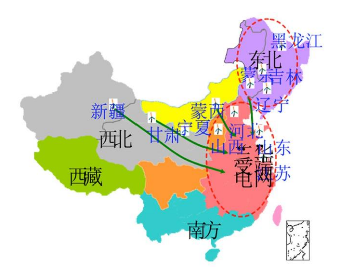
Figure 1. Example of wind power buildout from China that requires new transmission links. Large wind power plants are planned in the Northern part of China where there is not much consumption. Extra high voltage transmission lines are planned to transfer the power to load centres. (Source: SGERI).

The power flow direction may change, resulting in increased or decreased losses in transmission and distribution. Wind power may also increase or decrease bottleneck situations or congestion.