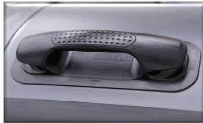
8 - Side Handle