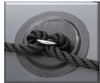
3-6 Internal & External "D" Ring