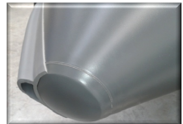
10 - HF Welded Cone