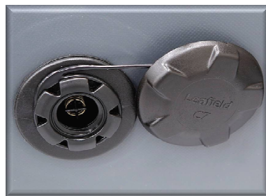
2 - C7 Leaffield inflation/deflation Valve