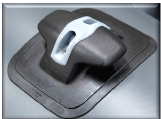
7 - Bow Cleat