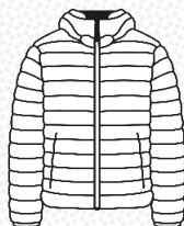
Packable & Light weight