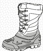
Removable Booties and Winter Boots* (*Outer shell boots to use COMPACT MX)