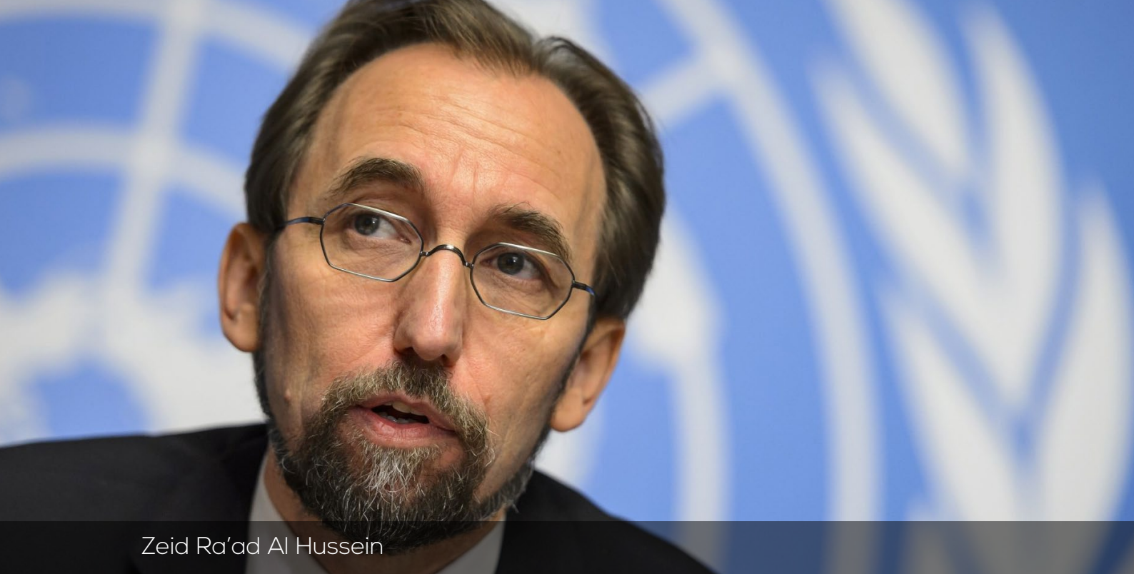
Zeid Ra'ad Al Hussein

the conflict. The devastation of Yemen and the horrific suffering of its people will have immense and enduring repercussions across the region. I appeal to the parties to the conflict to reach a negotiated and durable solution, and to adhere to their obligations under international law, including by facilitating the unimpeded delivery of humanitarian relief. I urge this Council to do everything in its power to seek a rapid end to this carnage.