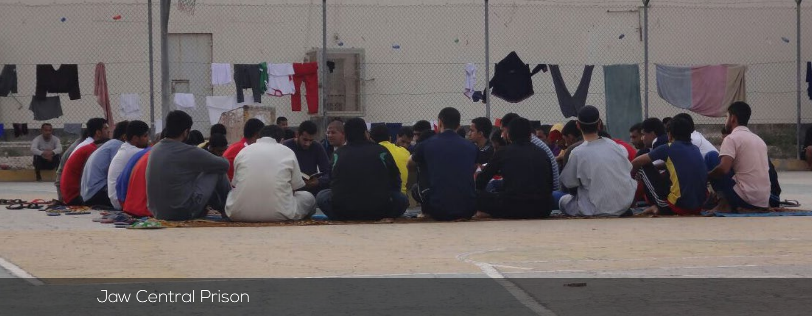
Jaw Central Prison