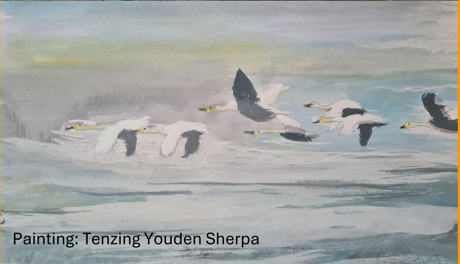
Painting: Tenzing Youden Sherpa