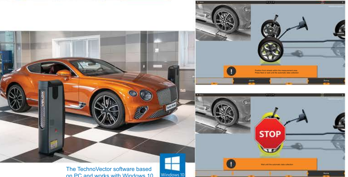
on PC and works with Windows 10