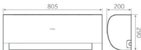
AS50 - AS71