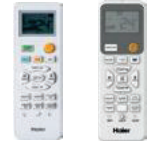
Standard YR-HE + YR-HE2