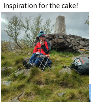
WHF National Field Day Weekend 2015