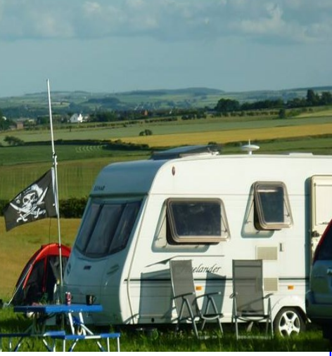
Our resident pirate