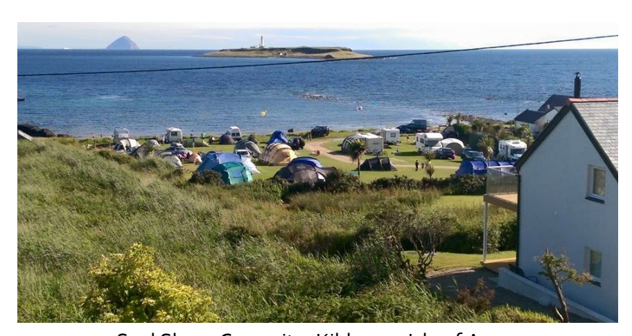
Seal Shore Campsite, Kildonan, Isle of Arran

For a more detailed write up of the IOTA expedition and more photos please read the excellent article written by Peter Day, G3PHO, the main event organiser. <a href="http://tinyurl.com/pjnptj5">http://tinyurl.com/pjnptj5</a>