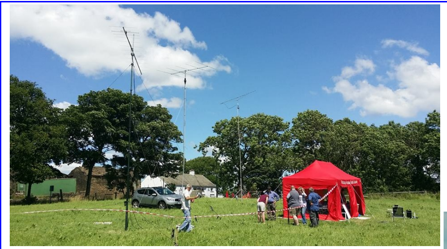
Masts up and ready to roll