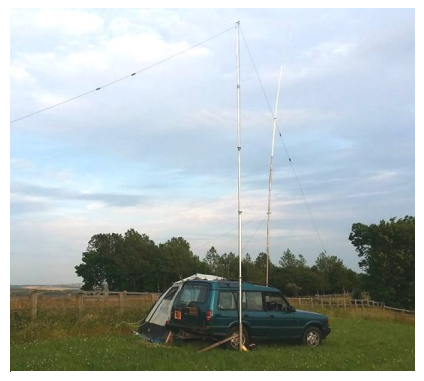
Have shack, will travel