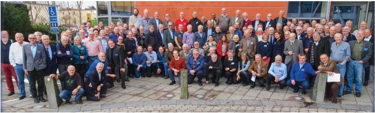
Figure 5. The Mölndal conference participants.