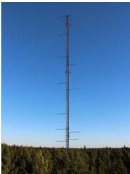
Figure 3. The ICOS measuring tower at Norunda.