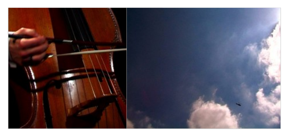
Surveillance helicopter filmed in Rome.

Eva Koch © 2005 / Stereo /4:3 / 2:18min / Denmark