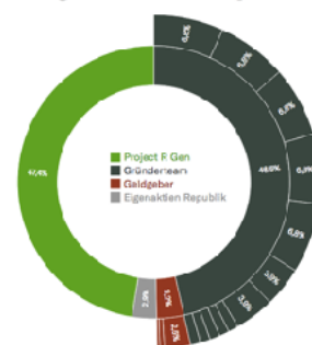
Aufteilung der Stimmen in der Republik AG

are an open-source cooperative, and we share our knowledge, software and business insights with others who also want to create journalism projects that reinforce democracy.”