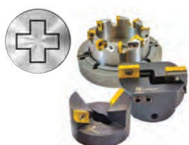
Toos for MF4-R from page 48