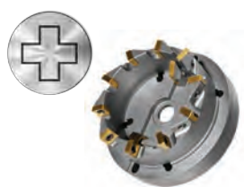
Tube fin removal from page 48