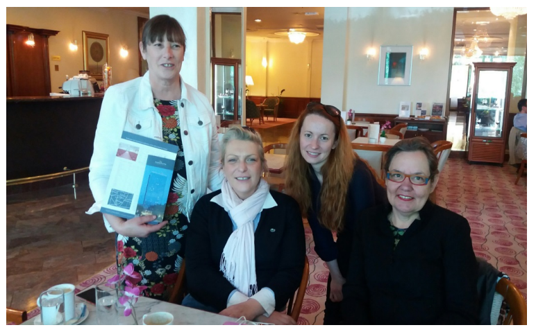
Inside the hotel inspecting the facilities which were found to be an ideal setting for our Annual Meeting.