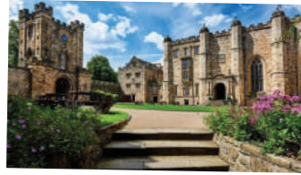
Beamish comes to Durham Castle, Saturday 26 July