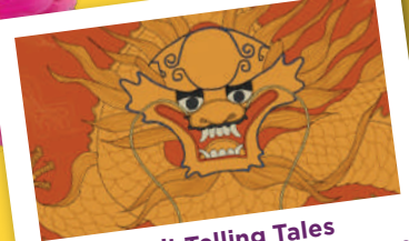
Free – Visit Telling Tales exhibition at Oriental Museum