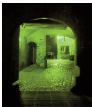
Leweston Chapel, Sherborne