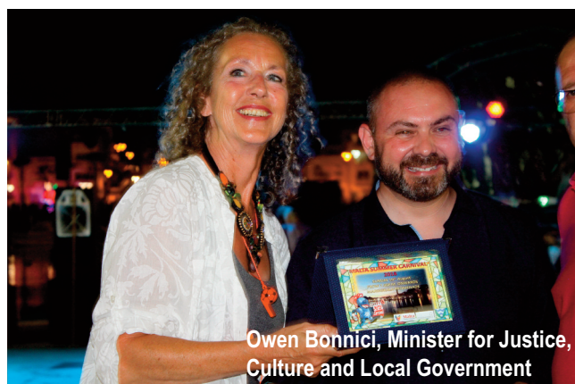
Owen Bonnici, Minister for Justice, Culture and Local Government