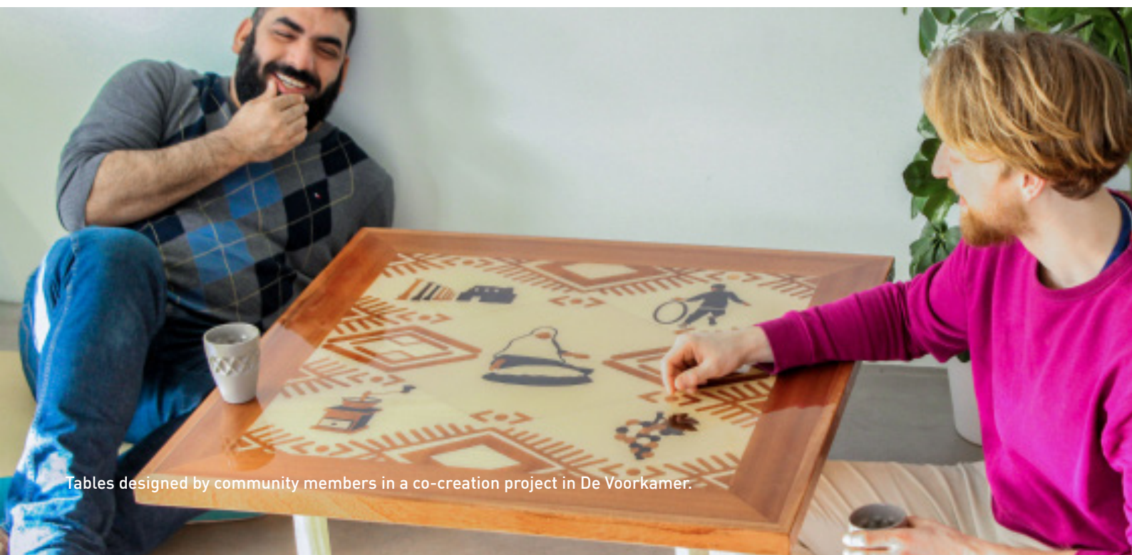
Tables designed by community members in a co-creation project in De Voorkamer.