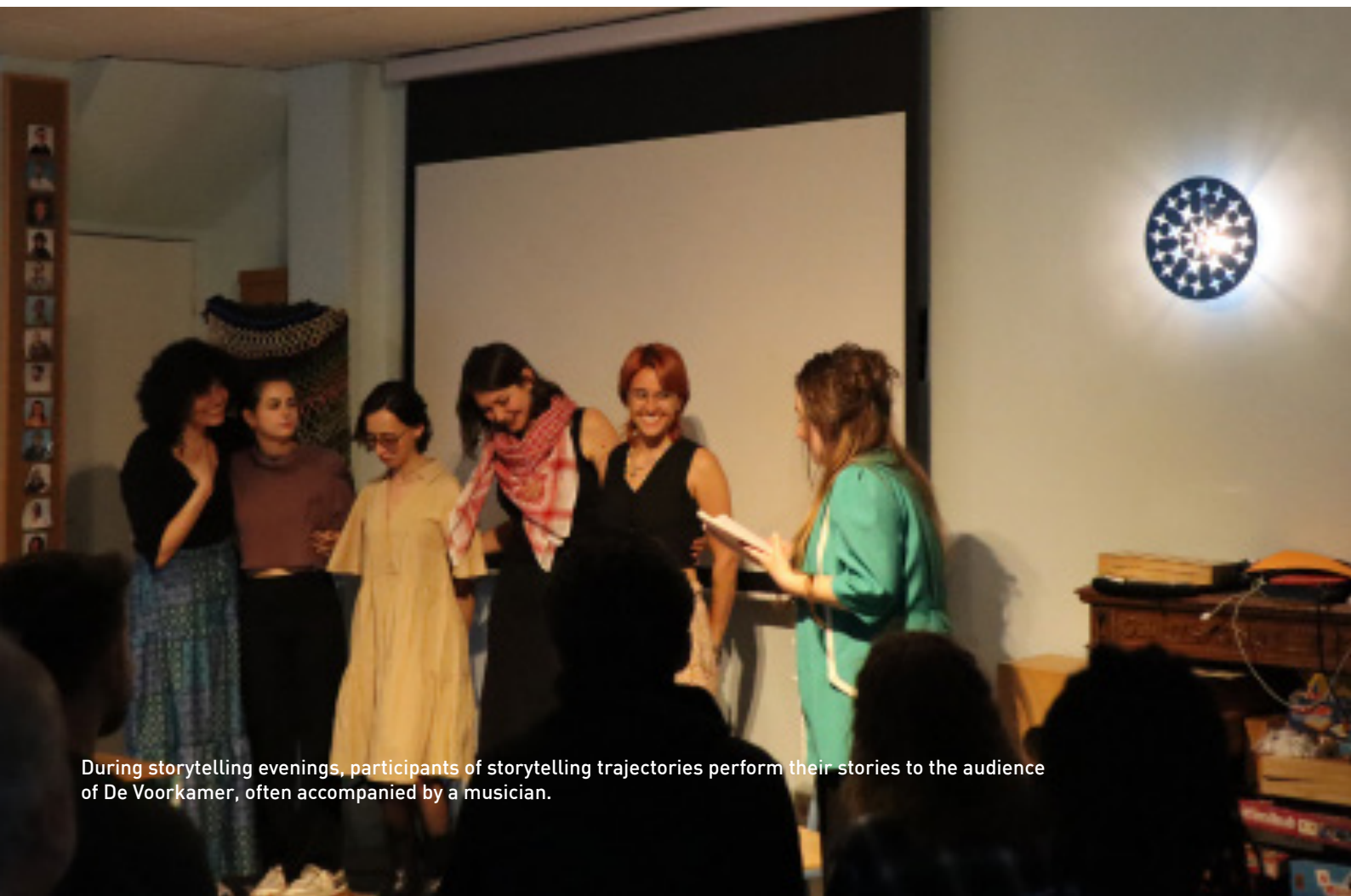
During storytelling evenings, participants of storytelling trajectories perform their stories to the audience of De Voorkamer, often accompanied by a musician.

If you have any questions please feel free to contact us!