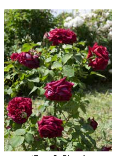
'Frau O. Plegg'