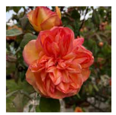
'Souvenir de Gilbert Nabonnand'

gigantea which might have resulted in re-blooming varieties in this class.