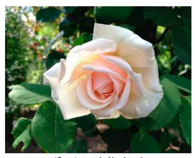
'Comtesse de Noghera'