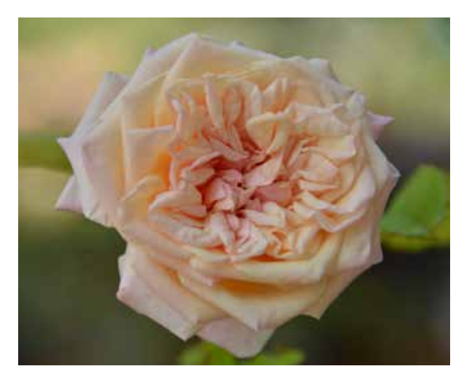
'(Mlle) Franziska Krüger'