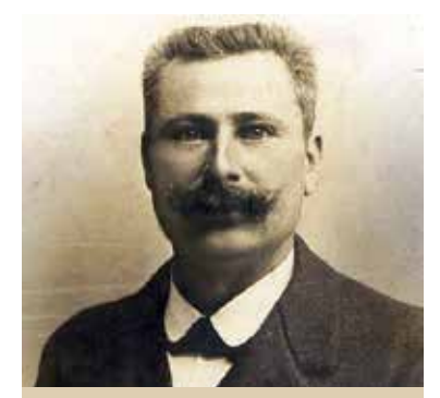
Clément Nabonnand