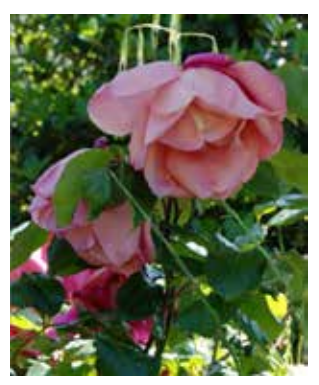
'Comtesse de Caserta' © P. Cavallo