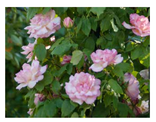
'Lady Waterlow'