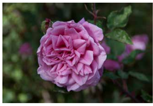
'Marie d'Orleans'

such as Jacotot ('Gloire de Dijon'). The most widely used varieties were 'Marie Van Houtte', 'Reine Maria Pia' and 'Gloire de Dijon'. For the latter, the Nabonnands would classify the varieties, either as Teas or as Noisettes, without justifying the precise reasons for their choice.