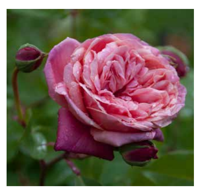
'Archiduc Joseph' © P. Cavallo

The following pictures are shown in alphabetic order