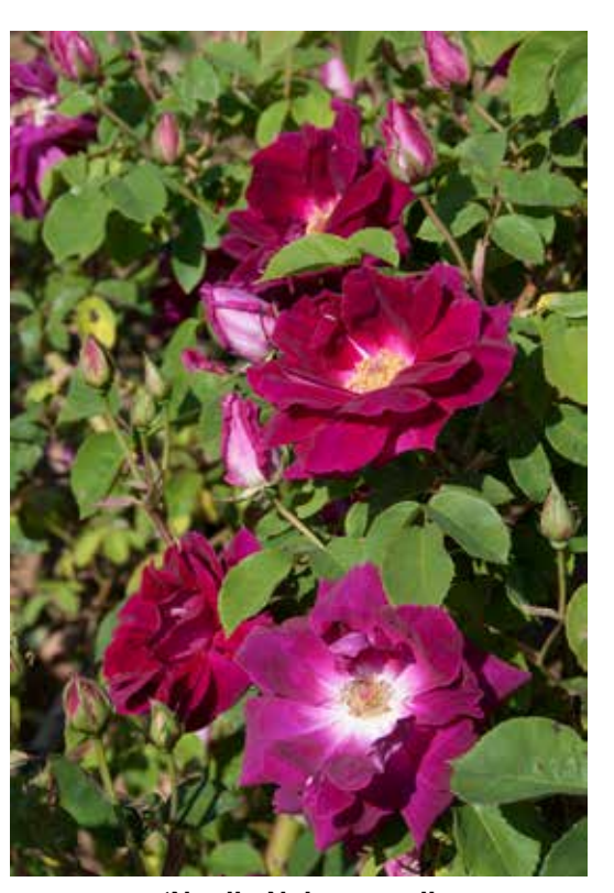
'Noella Nabonnand'