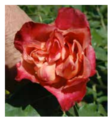
'Général Gallieni'

The participation of Nabonnand father and sons in exhibitions now extended beyond the regional area. In 1898, the newspaper Le Courrier de Cannes informed its readers of the successes they had achieved in Paris: "The skillful rose horticulturalists of Golfe-Juan obtained the highest award at the Paris Horticultural Exhibition, a gold medal for a collection of wonderful roses, comprising of 800 varieties."