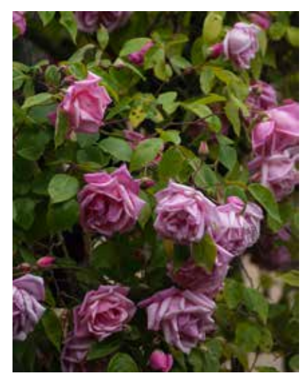
'Wasily Chludoff'

both pale pink Teas; '(Mlle) Franziska Krüger' (1879), a cream guartered flower Tea tinged with pink; 'Reine Olga de Württemberg' (1881), a fragrant crimson-red Noisette hybrid; 'Nardy' (1888), a Tea-Noisette with globular, vellow blooms that turn pink depending on the temperature; 'Papa Gontier' (1882), 'Madame la Princesse de Radziwill' (1886), 'Bardou Job' (1887), and 'G. Nabonnand' (1888), all Tea roses; 'Wasily Chludoff' (1896), a medium-pink climbing Noisette perfectly suited to grow over pergolas, 'Général Gallieni' (1899), a Tea with blooms of an unusual with mix of yellow, pink and carmine; 'Noella Nabonnand' (1900), a Tea with a powerful scent of rose emanating from a crimson corolla and 'Lady Waterlow' (1902), a strong growing hybrid Tea with very refined vellow flowers tinged with pink.