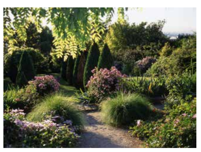
One of the many paths in the garden, this one bordered with 'Raubritter' and Pennisetum