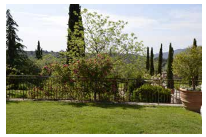
Domaine Saint-Jacques du Couloubrier © D. Massad

avenues planted with Nabonnand rose varieties which provide a constant field of color throughout the season. In Grasse, the Domaine Saint-Jacques du Couloubrier, owned by the Amics in the 1870s, has regained its magnificence after 15 years of restoration. This 8-hectare estate dotted with olive trees and Mediterranean species, hosts superb landscape creations: a garden created by Russell Page in the 1940s, a perfume garden, a melliferous meadow, a monumental rockery, a Provençal garden, a rose garden in honor of hybridizers, but also a unique