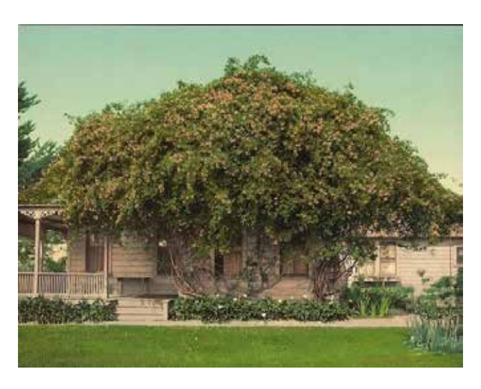
Photograph of 'Fortune's Double Yellow' Pasadena, California ~ 1902

Sometimes also called 'Gold of Ophir' (a reference to the land from which King Solomon's ships brought gold), this incredible rose can cover a garage or large shed in a spectacular mantle or blanket of gold. The variable and fragrant blooms are semi-double but sometimes full on short stems, but the canes are long and flexible and can be trained. As the long-lasting flowers age, the outer petals reflex, creating a loosely open blossom. A plant for warm climates, it continues to bloom intermittently after spring. In its early years in England, it was, writes Graham Thomas, "the most brilliant rose of its time." One such plant grows near me in California on a grassy lot where it covers a thirty-foot tree, lavish with thousands of roses each year that never get pruned.