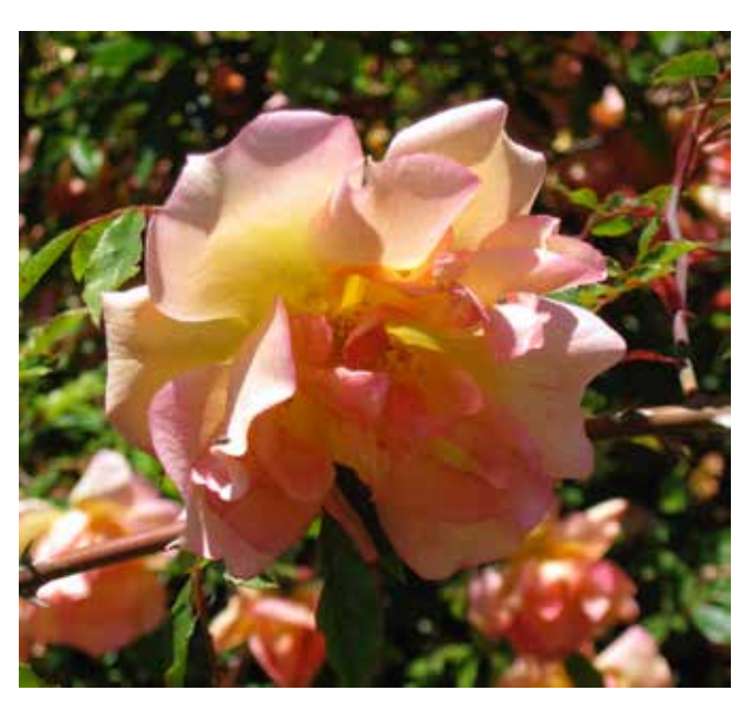
'Fortune's Double Yellow' © D. Schramm

The following year, 1845, Robert Fortune sent 43 Wardian cases of plants and seeds to the Royal Horticultural Society. Roses he sent were well-watered before being placed in Wardian glass cases, then their damp soil, eight to ten inches deep, was covered with moss and the cases sealed. These containers, according to the Society's journal of May 1,1846, included "Several Roses, among which is a fine new double yellow climbing kind." He had first seen it in 1844 on entering the Ningpo garden of a high public official of Imperial China, a Mandarin, where it "completely covered a distant part of the wall" as "a mass of yellow flowers" but "not a common yellow . . . masses of glowing yellowish and salmon colored flowers" which the Chinese called 'Wang-jang-ve'. The blossoms varied in their coloration. In 1850