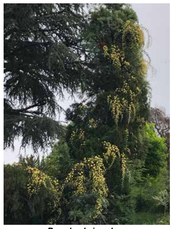
Rosa banksiae plena climbing through trees

Various perennials once deemed invasive are now welcomed and have become naturalized with the aid of our homemade compost: Althea rugusa, from the Caucasus sown more than thirty years ago to brighten up the clematis, Campanula Allliariifolia with its great spikes of little white bells that can withstand anything, Heucherella and Tiarella, Teucrium hircanum, Chamomilla vulgaris, the scented-leaf Geranium Macrorrhizum and Brunnera macrophylla, the Caucasus forgetme-not.