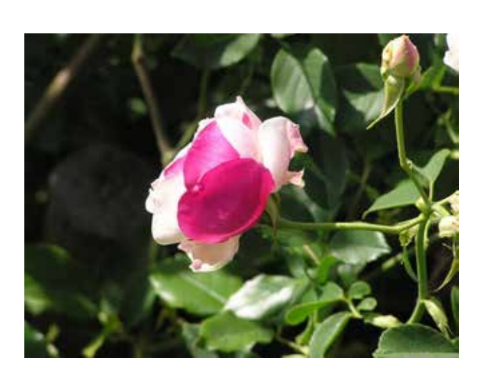
'Fortune's Five-colored Rose'