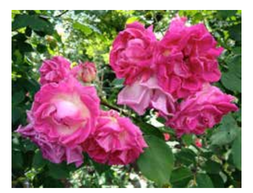
'Monsieur Rosier'