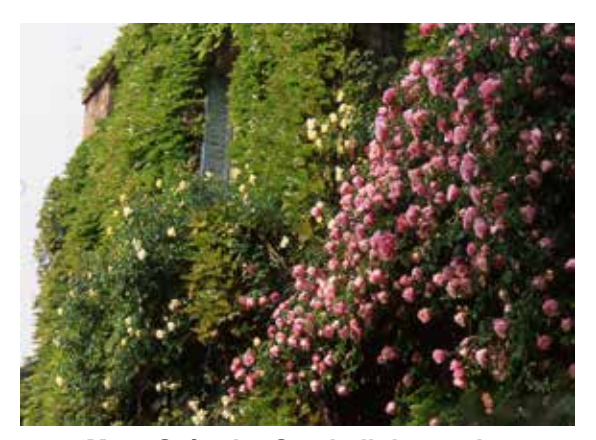
'Mme Grégoire Stachelin' covering the house

My garden made up of collections brought together with joy, patience and passion over more than forty five years will, within a few months, evolve and become simpler before it turns into a "Green Area," then becoming wild and, in all likelihood, disappear. Never having been in the hands of a landscape designer or a professional gardener, the garden has adjusted itself to errors and creative whims.