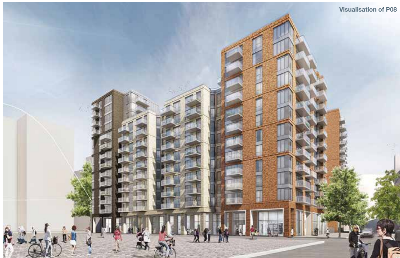
Visualisation of P08

P22 seeks permission for a riverside pavilion, designed by Marks Barfield Architects, set in a 0.53 ha jetty park with a new river bus stop. The building will initially be used as a marketing suite then convert to a waterside restaurant/bar.