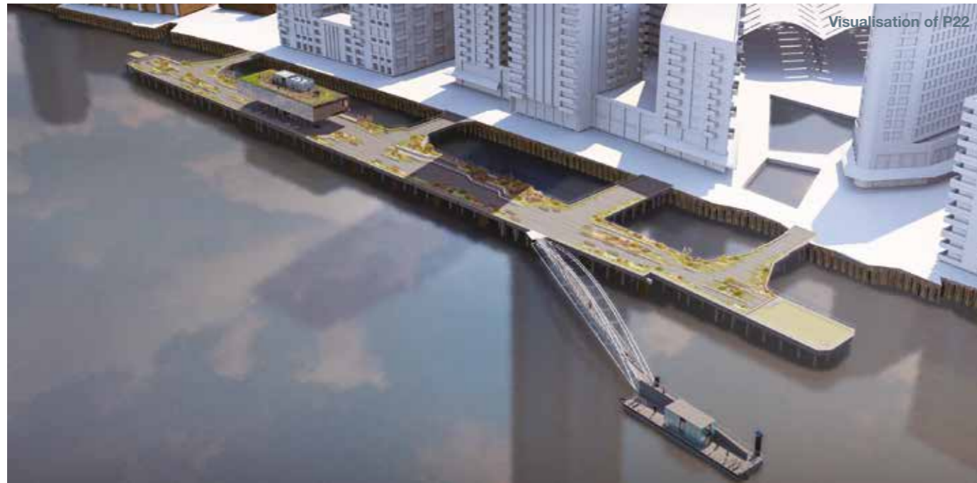
Visualisation of P22