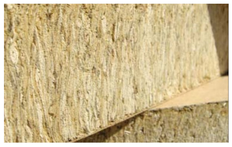
© Compressed Straw Boards by Durra Panel

The manufacturing process converts an agricultural by-product and wastepaper into a building material that at the end of its useful life is recyclable and biodegradable. At the end of its lifetime, it can be easily dismantled for reuse and its components are biodegradable, and if no chemical adhesives are used, it can be incorporated back into the soil.