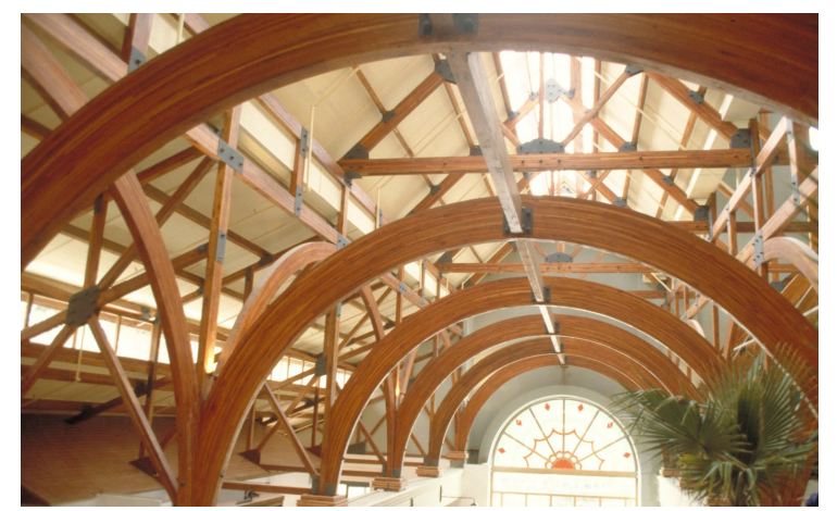
Village Walk Mall

Being conscious about where timber is harvested from plays a significant role in creating carbon stores and lowering greenhouse gas emissions. The ability to protect and restore these forests lies within the biodiversity of these ecosystems.