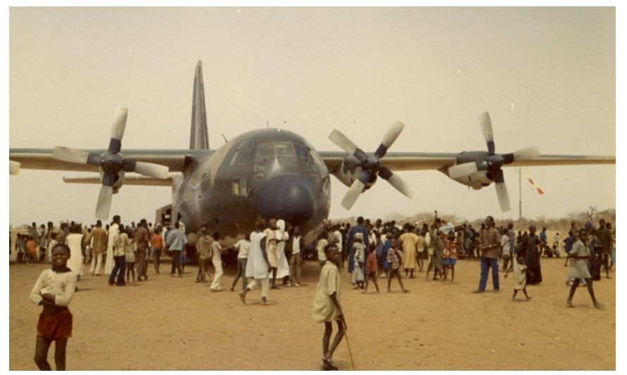
- Humanitarian Aid Mission by 15 Wing C-130 in Eastern Africa.