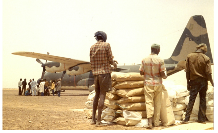
Delivering another cargo load of humanitarian aid.