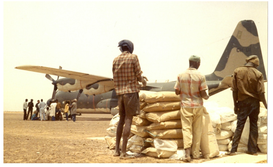
Delivering another cargo load of humanitarian aid.