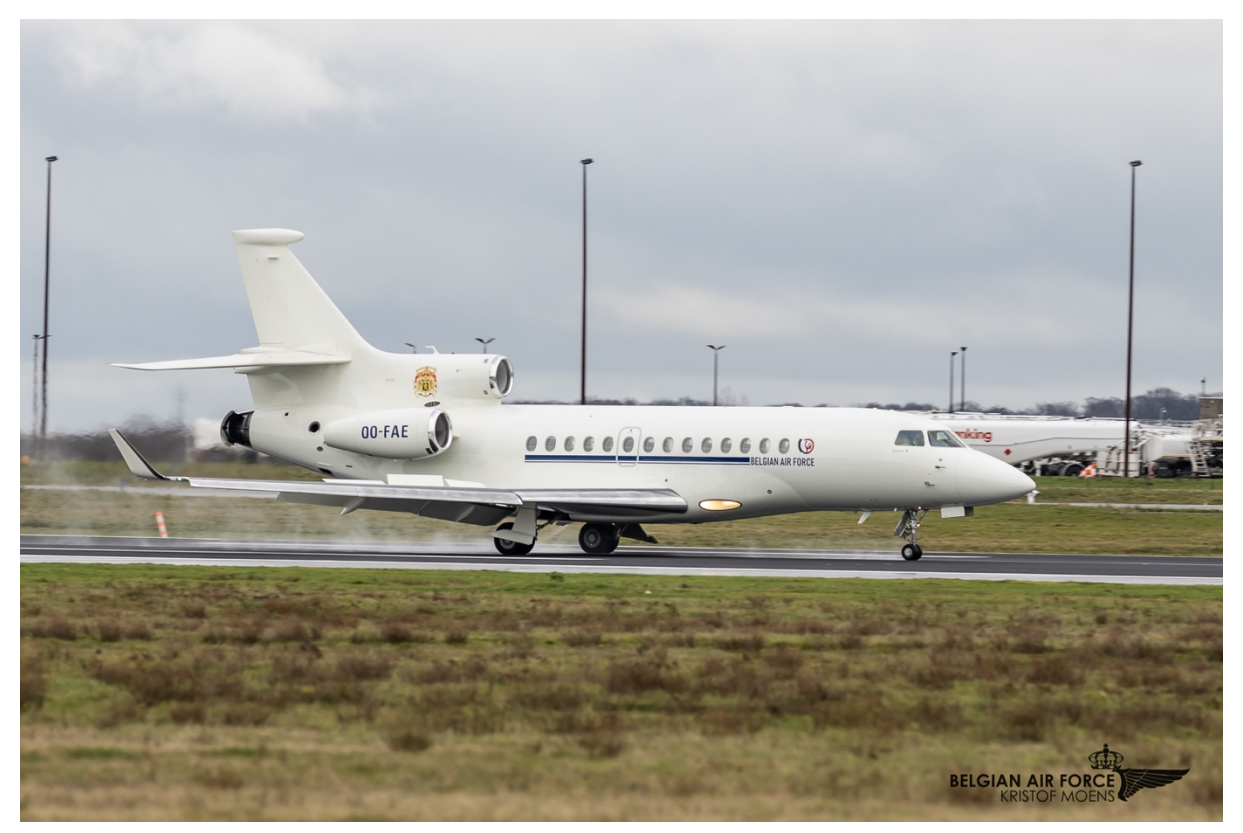
Dassault Falcon 7X

Airbus A321-231 (reg. CS-TRJ) with a capacity of 152 passengers leased since May 2014 from Portuguese company HiFly made its final flight from Melsbroek in December 2020. The reason was that Belgium had joined the NATO Multi Role Tanker Transport ( MRTT ) Program with Airbus A-330 to be stationed at Eindhoven, The Netherlands.