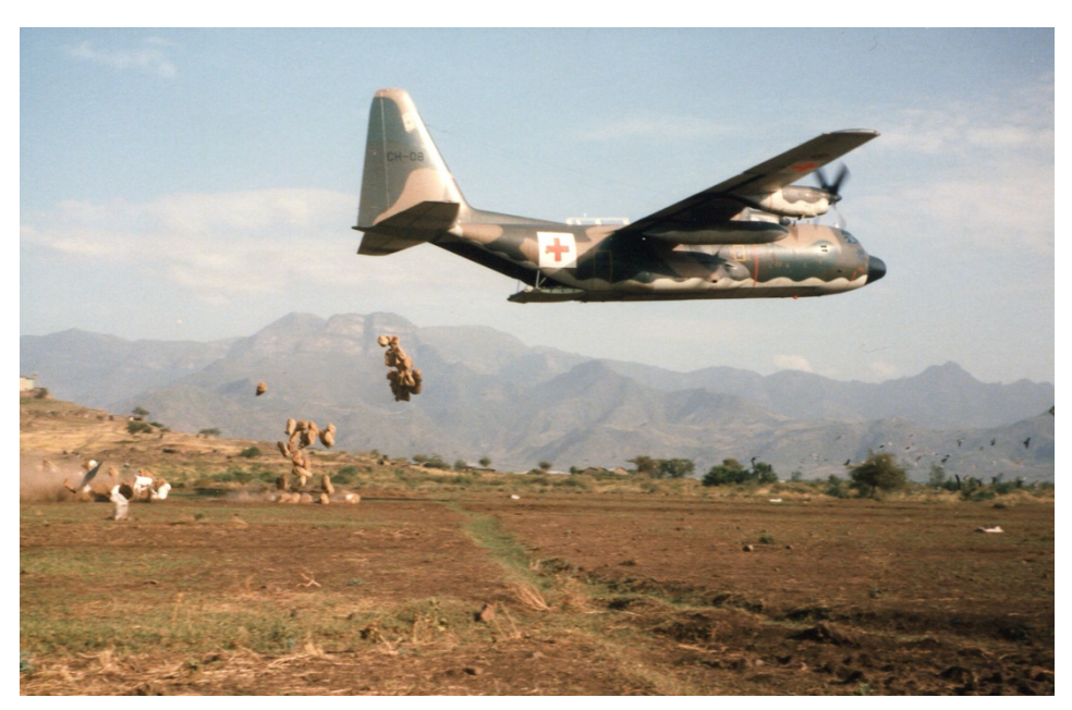
Low Level dropping of humanitarian Aid in Africa.

During this time, 15 Wing developed a system of free drops, as braking chutes were unknown at that time. The aircraft would approach the drop zone at a height of 20-30 meters, with minimum flying speed and at the captain's go, the aid packages were pushed out of the plane. The risks involved were high but the crews of 15 Wing did a sterling job and never lost an aircraft. The system developed by 15 Wing later became known as VLAD (Very Low Altitude delivery) and was the precursor to the current world standard VLAGES drop technique ( Very Low Altitude Gravity Extraction System ).