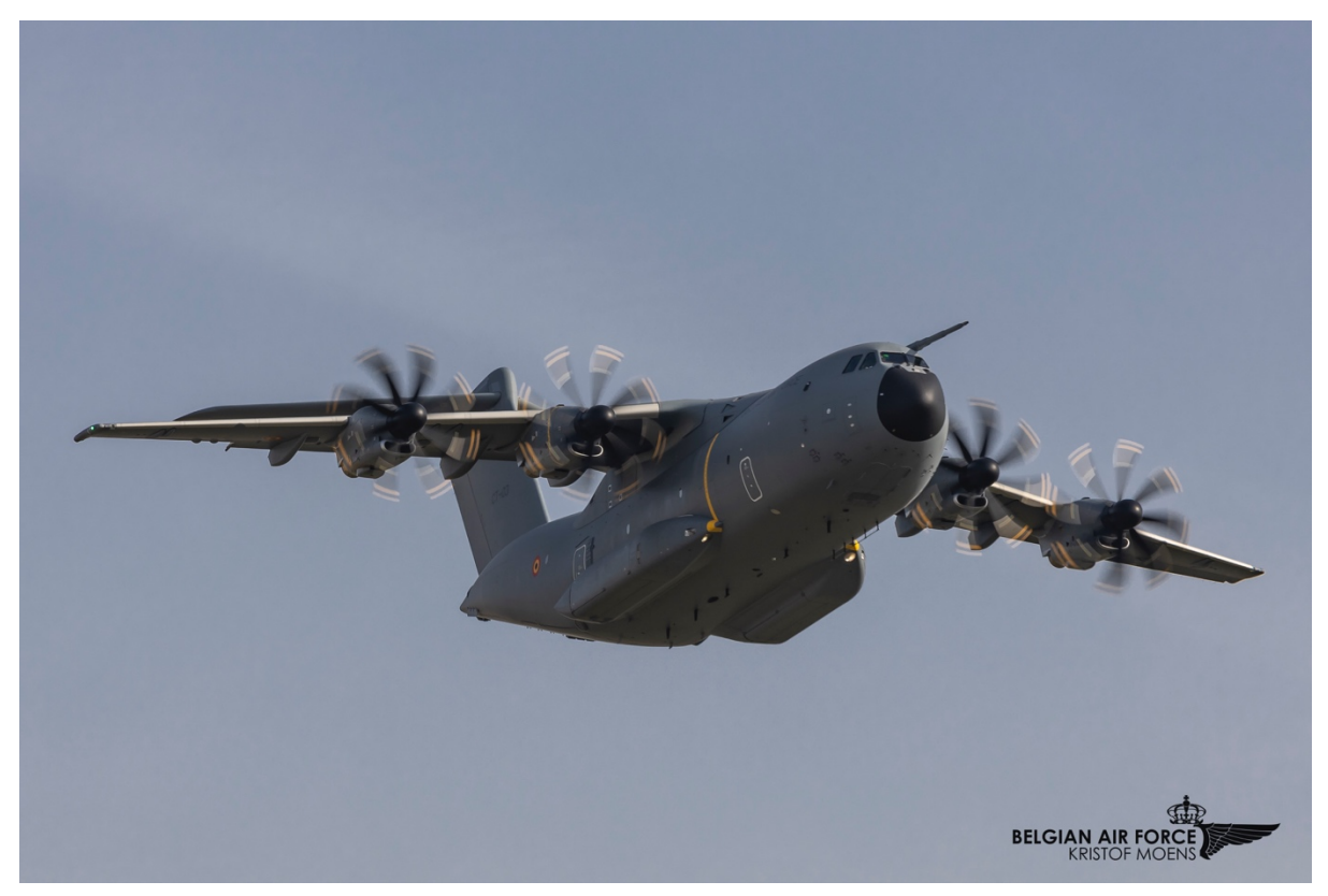
Approach of Airbus A400M towards Melsbroek