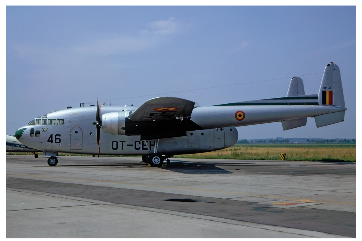
The delivery of the C-119 was a phased process as the initial batch of 18 C-119F (built in 1952) were complemented in 1953-54 by another 22 C-119G and a follow-up buy of six more Gs in 1958.

Budget restrictions led to the initial 18 C-119F aircraft to be put in storage before being eight of those transferred via MAAG-BELUX to Norway, the 10 remaining being handed back to the USAF. The 'Norwegian' Boxcars remained American property and were after their retirement flown in full USAF livery back to Tucson, AZ.