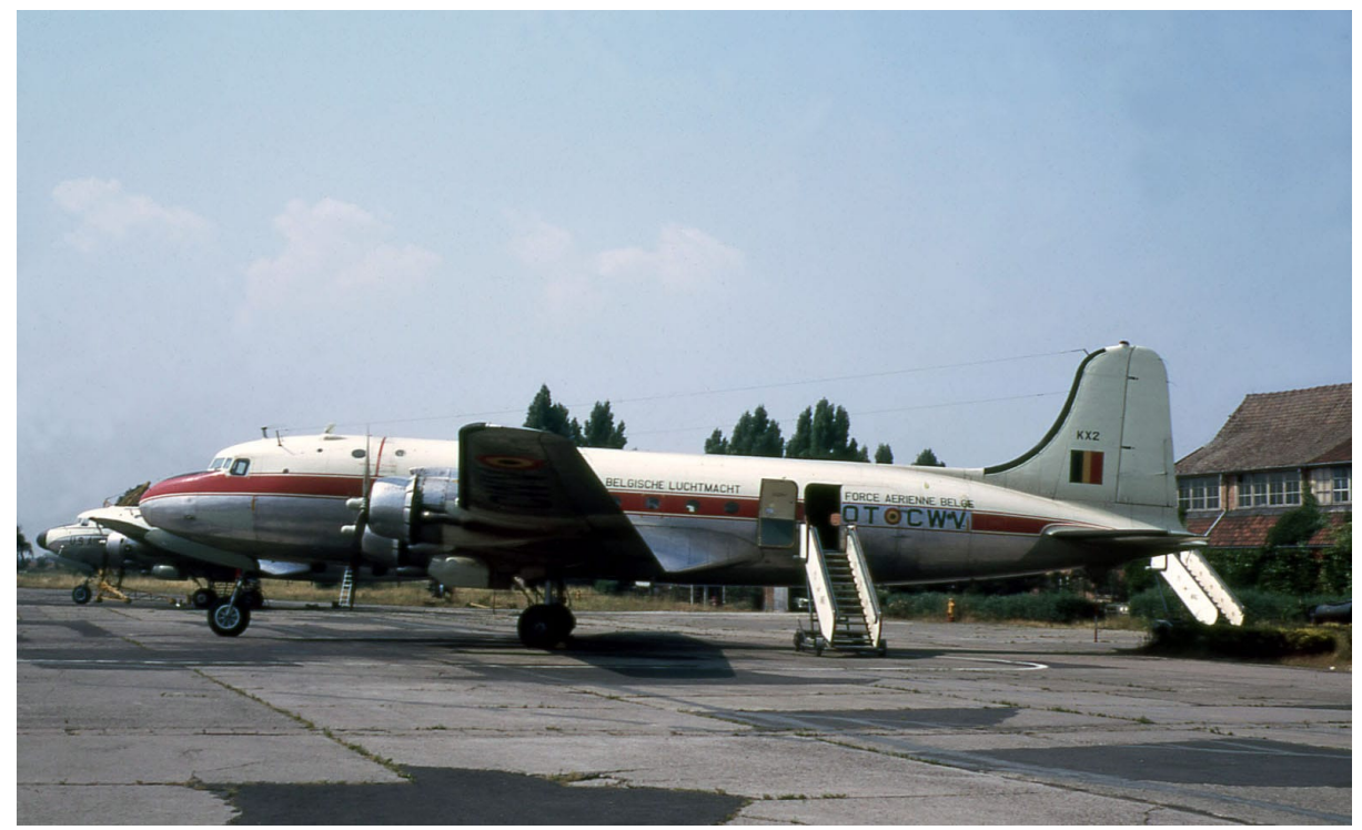
DC-4/C-54 OT-CWV next to a USAF C-54 Skymaster

from SAS in May 1954. The KX-1 and -2 registered Skymasters now did the Brussels-Tripoli-Kano-Leopoldville-Kamina trip in a day and a half – and became the backbone of the air link between Belgium and the Belgian Congo.