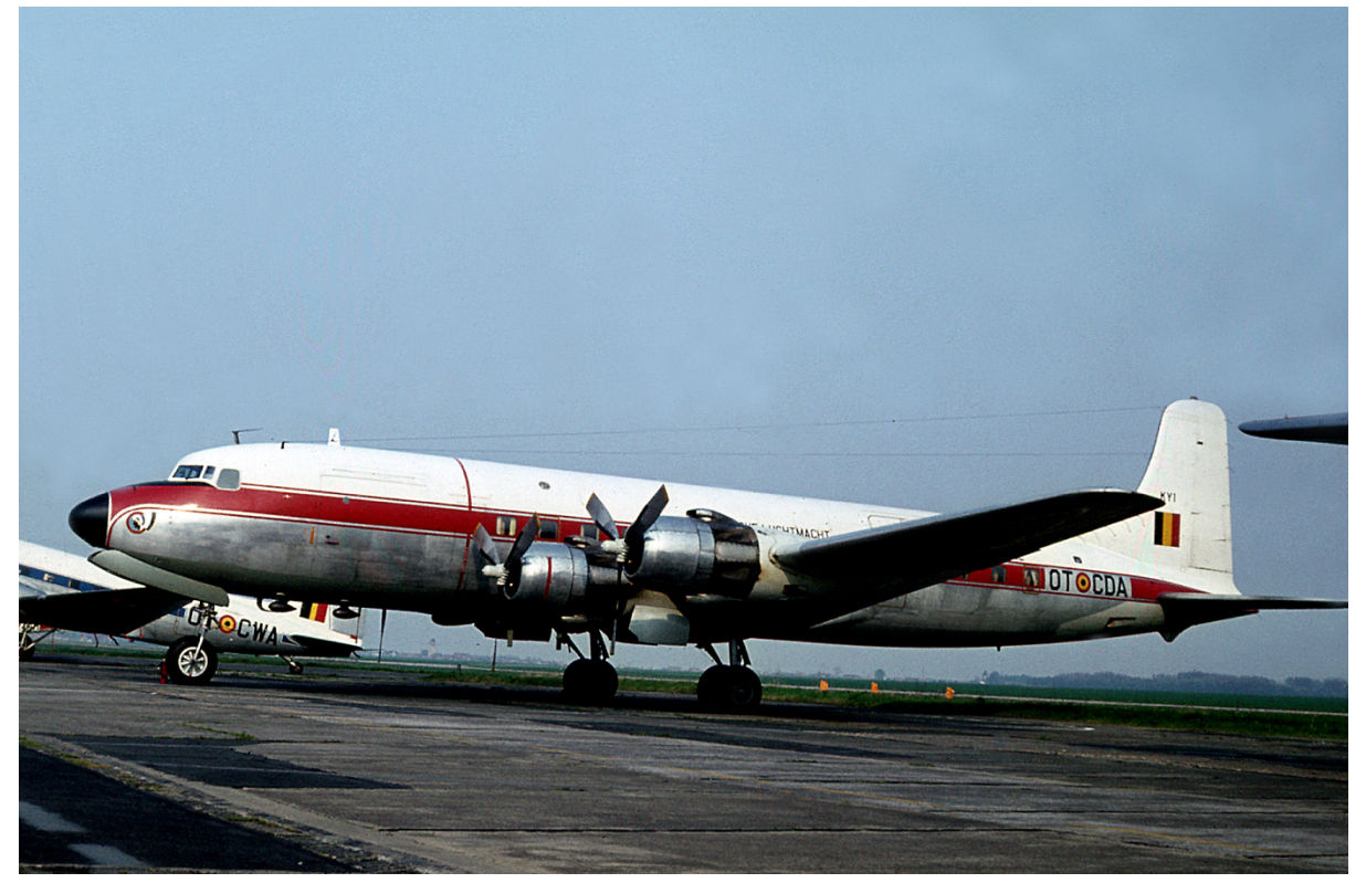
Belgian Air Force DC-6B OT-CDA, parked next to C-47 OT-CWA at Melsbroek

Meanwhile, as the focus on the Congo remained high in the turbulent years prior to its independence in 1960, the 50-seat DC 4 proved not as reliable as hoped for. Their lack of pressurization and the unpredictable weather patterns over Africa necessitated long detours and high fuel consumption as the aircraft was forced to fly below 10,000 ft. Hence the decision of the Air Force in 1958 to acquire two USAF DC 6A and two more DC 6B from SABENA in 1960. One of which, the KY-2, became a Royal Flight VIP aircraft.