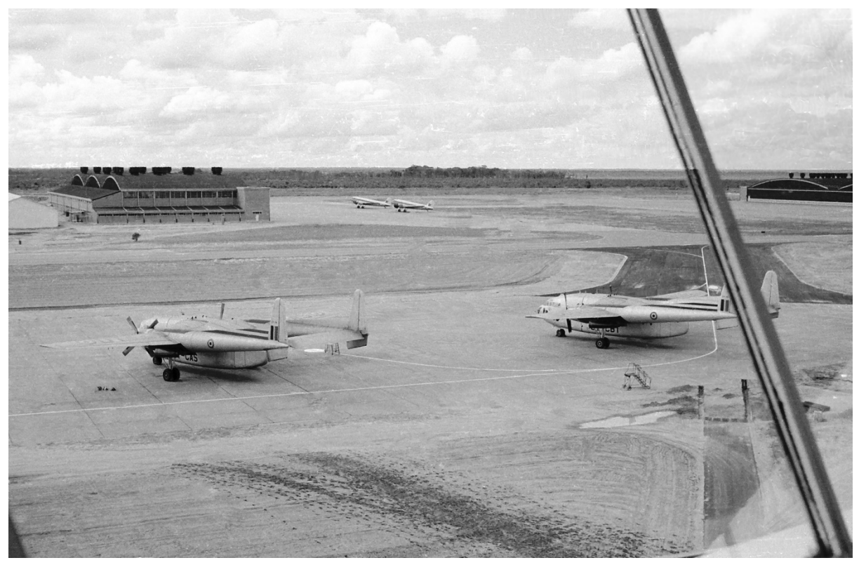
Taken from the Tower at Kamina, two C-119s stand parked while two more C-47 in the background.

With the C-47 in the process of being phased out, the Belgian Air Ministry decided on a major strategical leap forward and structure 15 Wing as a genuine tactical air transport wing – a smart forward-looking move as it turned out.