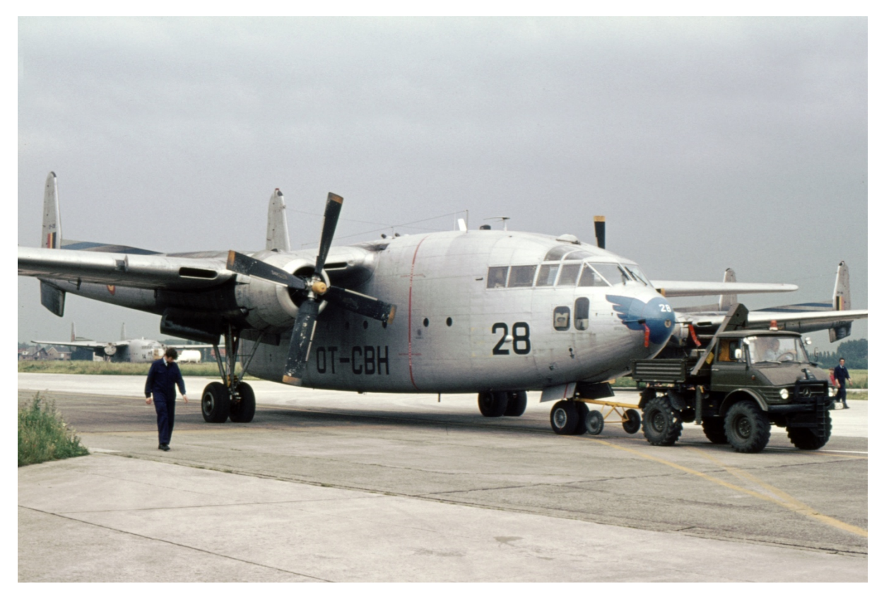
C-119 OT-CBH in 1972