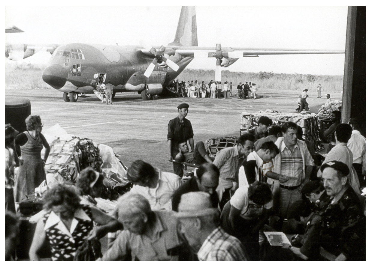
Kolwezi, 1978.

Belgium immediately took action and marshalled 10 C-130 Hercules and its two B-727 for the support and relief operation, codenamed 'Red Bean'. SABENA flew in the rest of the Para regiment on eight B-707 flights. In a coordinated campaign, the rebels were pushed out of Kolwezi, liberating hundreds of Europeans and flying them to safety. The complex operation, involving USAF C-141 to ferry fuel in, one C-130H temporarily was kitted out as a tanker aircraft, shuttling 24/7 between Kamina and Kinshasa to ensure that flying operations were secure. The operation ended May 20, 1978 with the uprising crushed and Kolwezi back under control of local forces. 2,200 Europeans and 3,000 Africans were evacuated, while 60 Europeans and about 100 Africans were massacred. One Belgian paratrooper was killed in the operation.