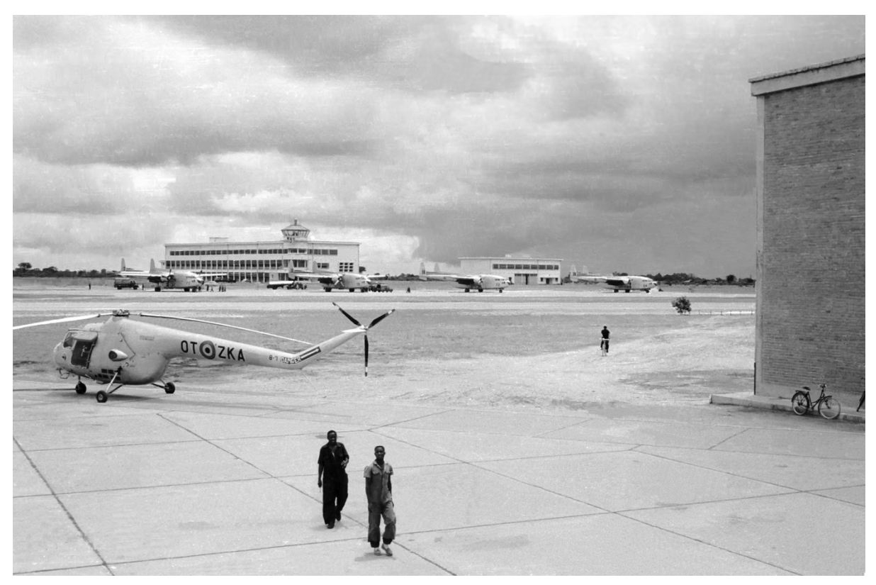
Kamina AB, 1959: Three Bristol Sycamores with C-119s parked before the airport building.