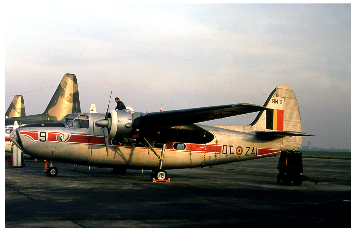
Percival Pembroke OT-ZAI (RM-9) at Melsbroek.

The Pembrokes had been acquired to serve in the Congo; but the C-119 had proven that a high-wing aircraft with a stiff wing design were not suitable for photographic reconnaissance in the turbulent weather conditions of Africa. They were kept in storage at Wevelgem airport until they were integrated into 15 Wing.