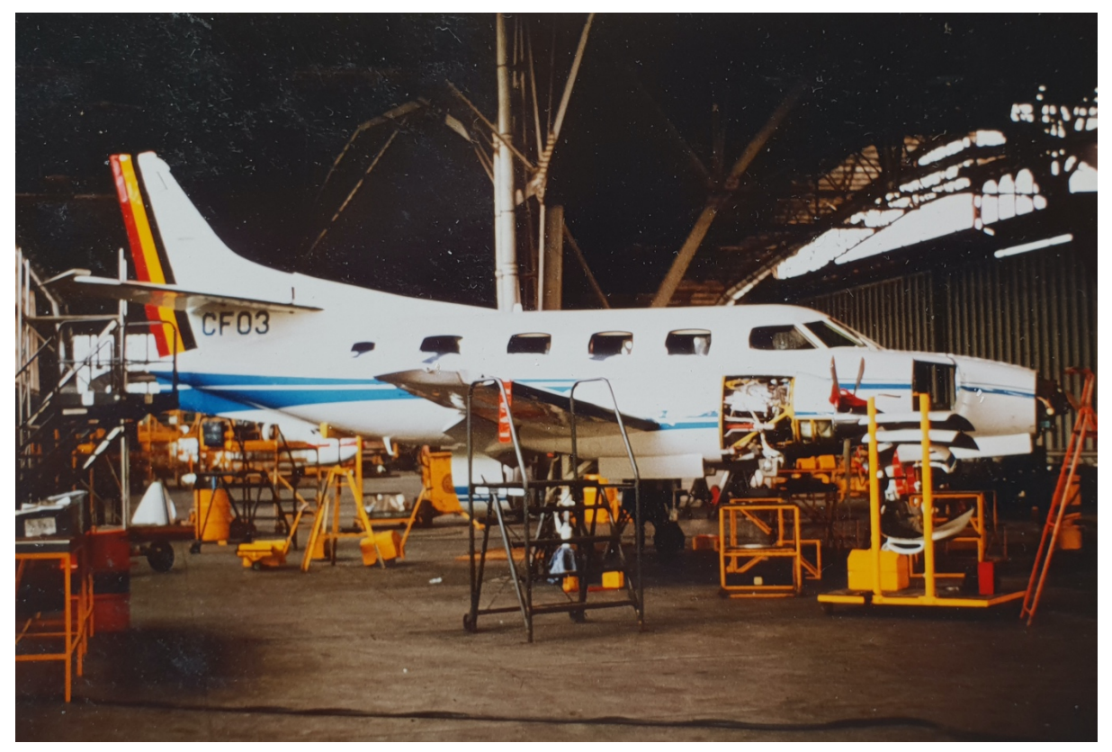
Rare photo of Swearingen 3 Merlin CF-03 during maintenance at Melsbroek. The CF-03 crashed at Lille-Lesquin, France on April 16, 1980 with the loss of both pilots.

The Pembrokes were complemented by two Swearingen 3/Merlin while two new Dassault Falcon 20E for VIP flights, urgent medical flights for organ transplants and fast airlift of patients. That same year, 1976, saw the four DC 6 being replaced by two former SABENA Boeing B 727 and the first of three Hawker Siddeley HS 748.