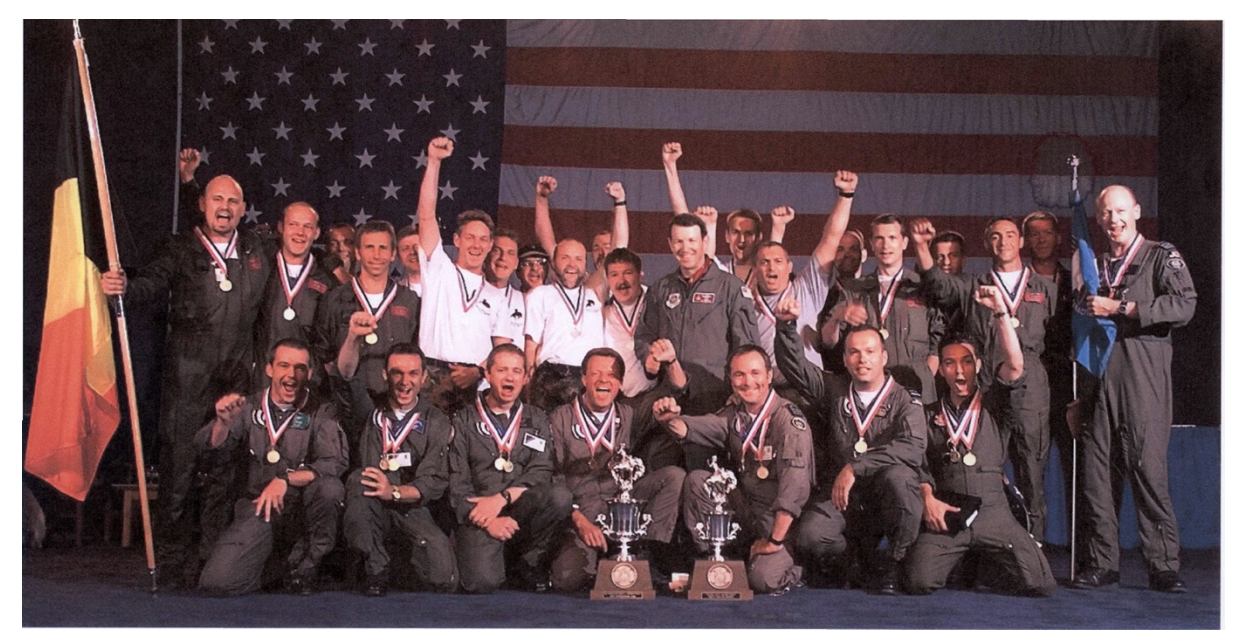
15 Wing went home with two top prizes for Belgium: Best Air Crew and best International Team! Good Show !!